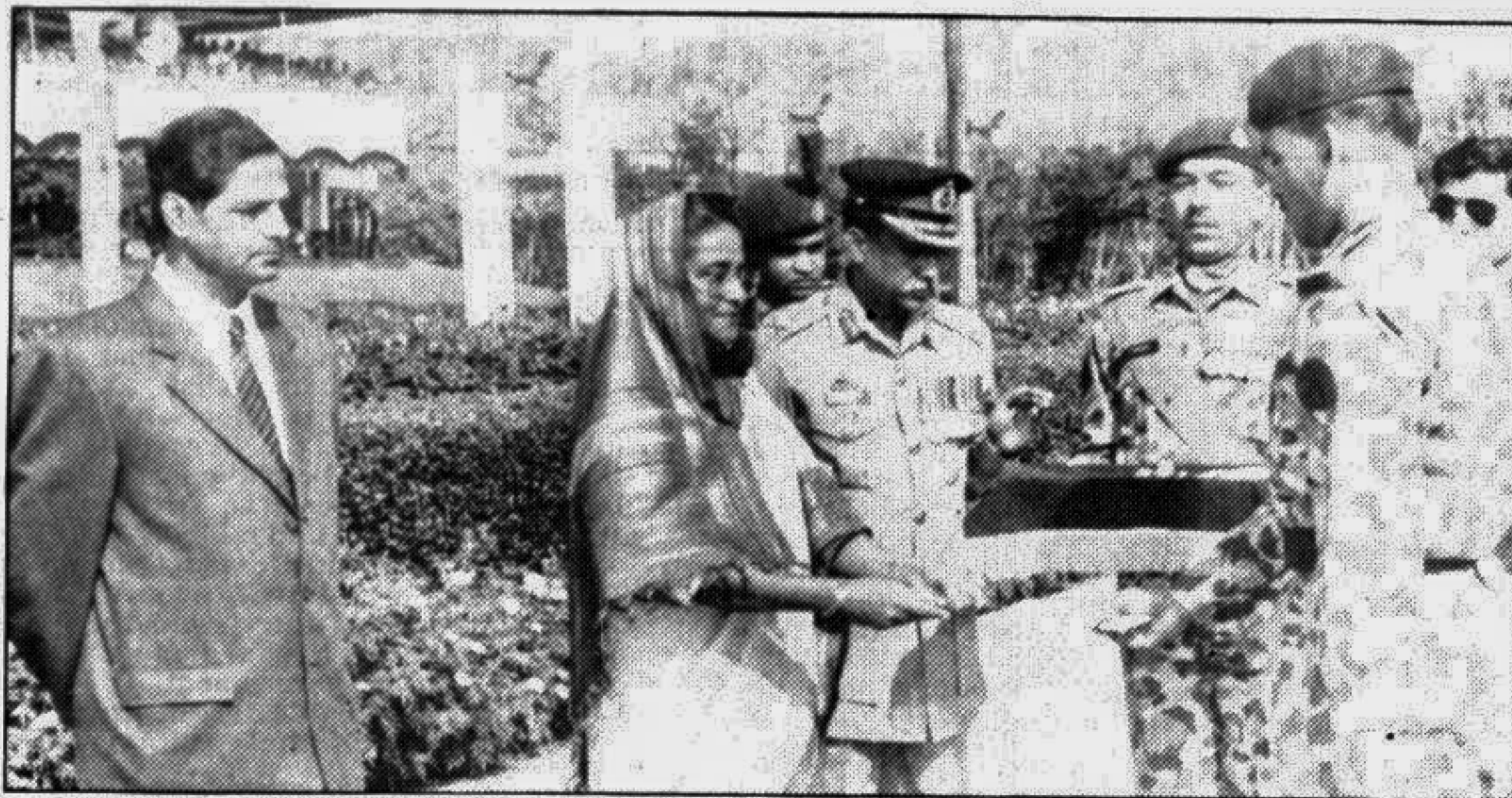
Prime Minister Sheikh Hasina presenting a medal to a BDR personnel at the inaugural of Bangladesh Rifles Week-98 at BDR Headquarters, Peelkhana, in the city yesterday.