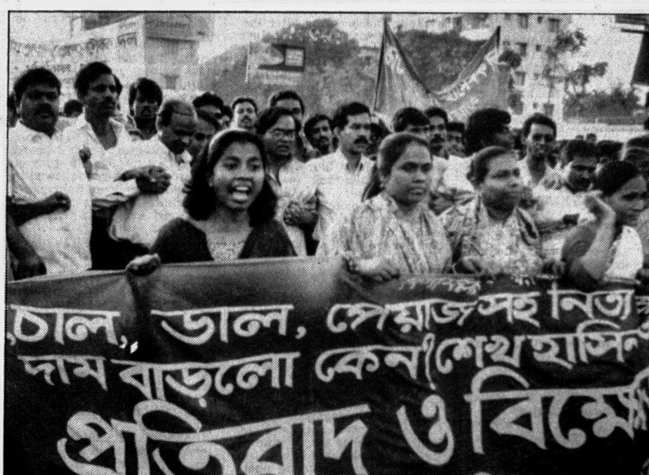
Jatiyatabadi Sechhasebak Dal brought out a procession in the city yesterday protesting price hike of essentials.

Prime Minister Sheikh Hasina yesterday stressed the need for freeing the country from the curse of illiteracy to ensure human resources development, reports UNB. "The government has taken up massive programmes for the spread of education and given highest priority to poverty alleviation," she said, inaugurating the mosque-based primary education programme at the Osmani Memorial Hall in the morning. Addressing the imams from across the country, who will run the mosque-based programme for the children, Hasina emphasised the need for proper religious teaching. Lack of proper religious teaching leads to fanaticism and misinterpretation of religion," she said. Under the programme, the imams of mosques across the country will impart primary education to the children in their respective areas under the supervision of the Islamic Foundation. The imams will be trained for the purpose and provided with a monthly remuneration of Tk 500 to run the programme. More than 2.5 lakh mosques in the country will provide space, teachers (imams) and other facilities to make primary education accessible to the local children. The Prime Minister said, "It will be possible to introduce Class I and II in the mosques by utilising the huge manpower available at negligible cost." With the implementation of the programme, two major problems in the expansion of education — shortage of class rooms and teachers — can be removed to a great extent, she added.