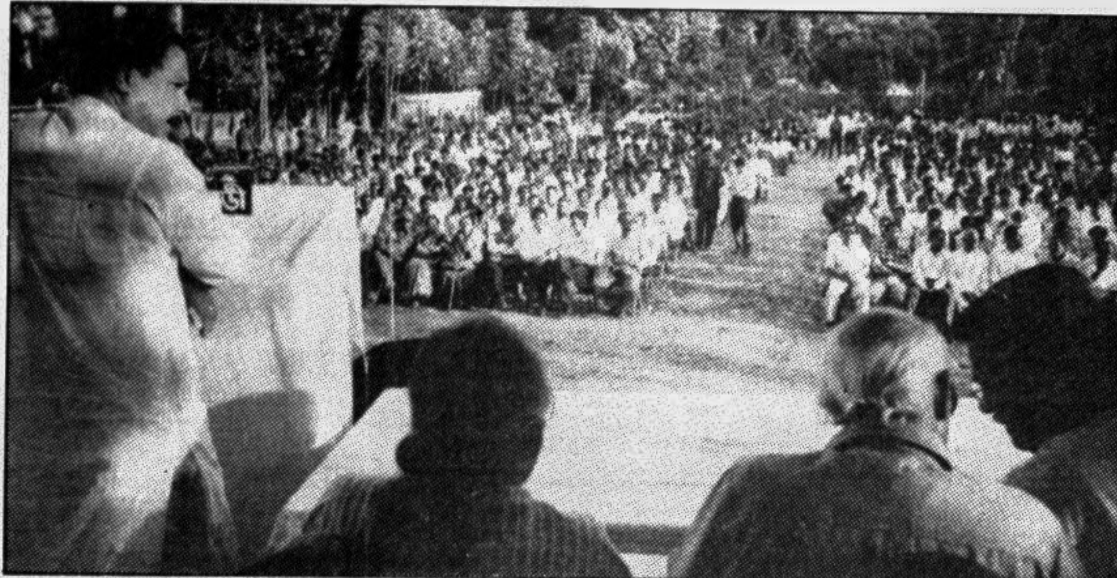
Jatiya Samajtantrik Dal (JSD) leader A S M Abdur Rab addressing a discussion meeting commemorating 'flag-raising day of free Bangladesh' at Ramna Botomul yesterday.