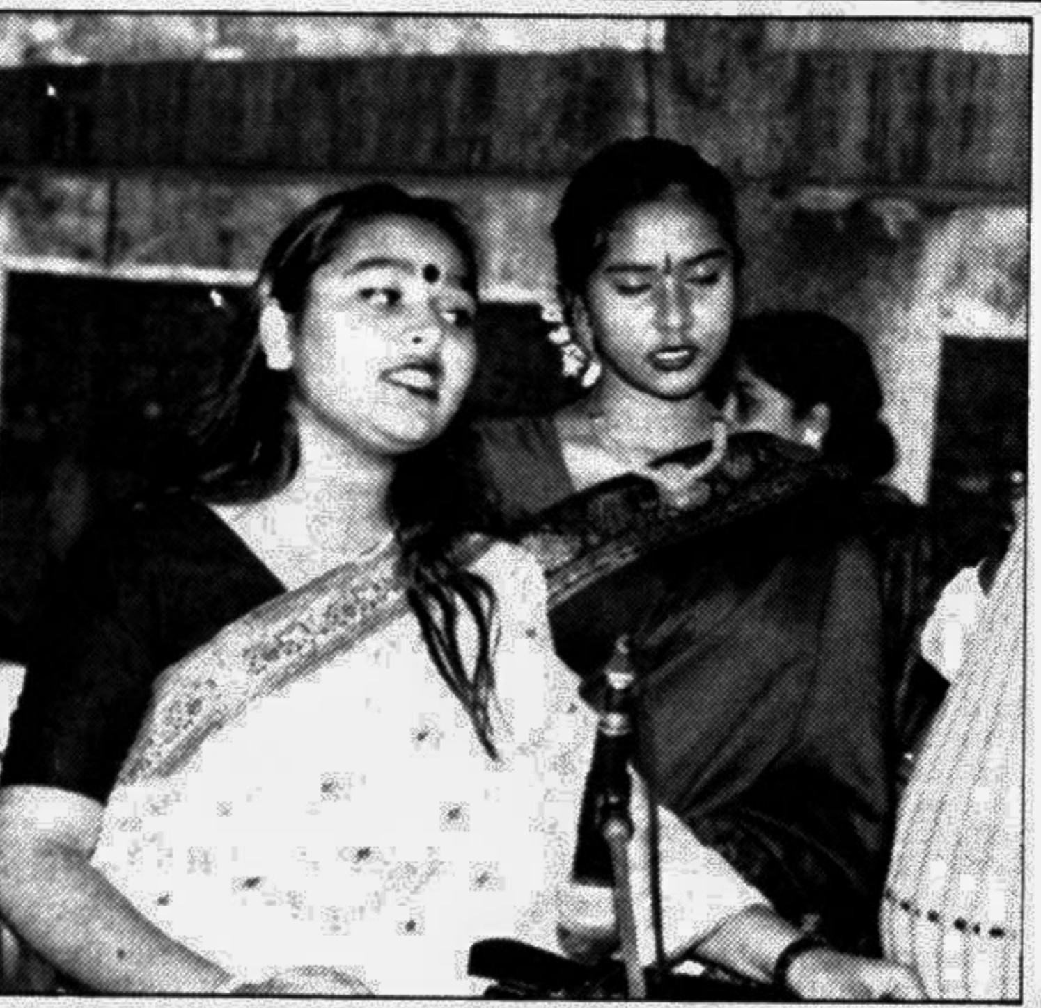
A student of Udayan Bidyalaya rendering songs at the annual prize giving ceremony of the school yesterday.

Relatives and well-wishers are requested to attend the chehlum.