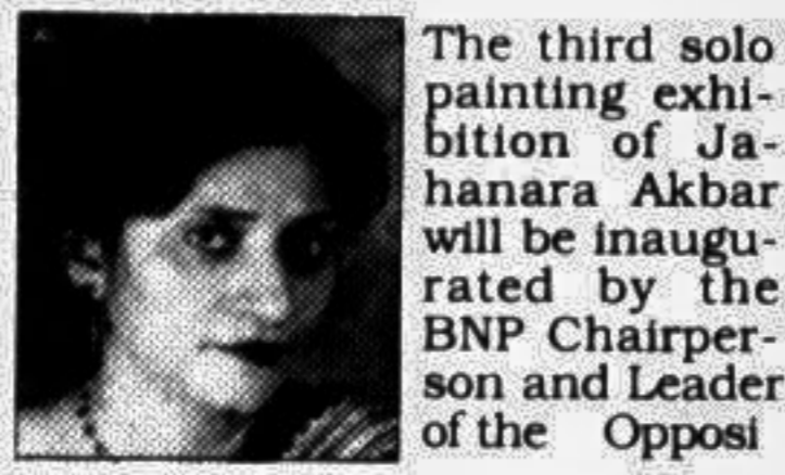
The third solo painting exhibition of Jahanara Akbar will be inaugurated by the BNP Chairperson and Leader of the Opposition in Parliament Begum Khaleda Zia today at 5 pm at the Drik Gallery.

The exhibition will remain open till March 2 from 3 pm to 8 pm. 45 items of painting and pottery and crafted saracs are on display.