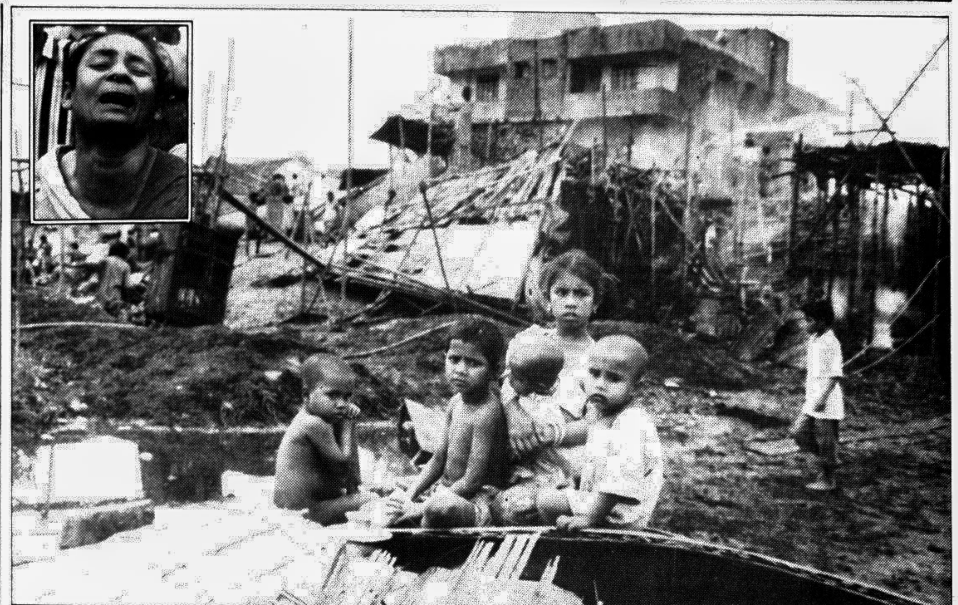
A fire gutted a slum at Rayer Bazar in the city yesterday. (Inset) A slum dweller wailing.