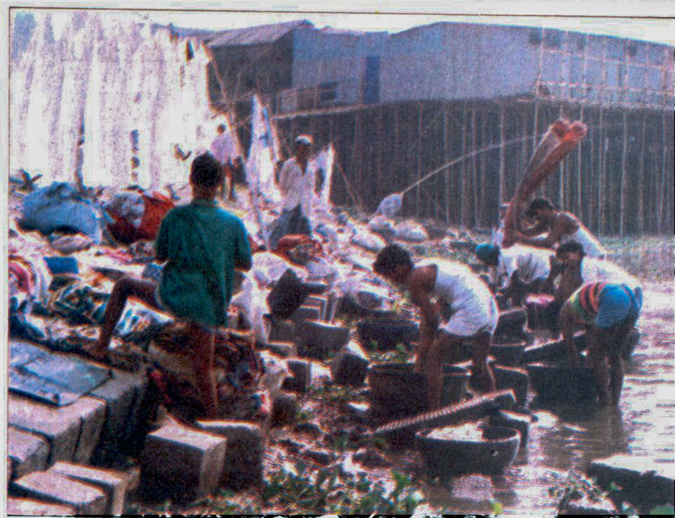
Most of the laundry shops in the city use the Buriganga river to wash clothes, polluting its water.

The accord spells out the guidelines for inspecting the presidential sites in one paragraph. The inspectors would be accompanied by diplomats, sources said, and it discusses a critical issue for Iraq — lifting economic sanctions imposed after the 1990 invasion of Kuwait. See Page 12 Col 7