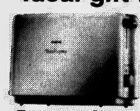
Toaster - 2 Slices