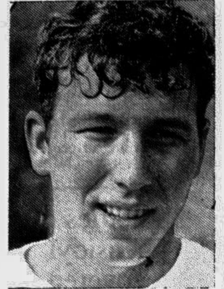
Mike Atherton (England cricket captain) "I have played in a few extraordinary Test matches. But nothing can surpass the remarkable scenes at Sabina Park."