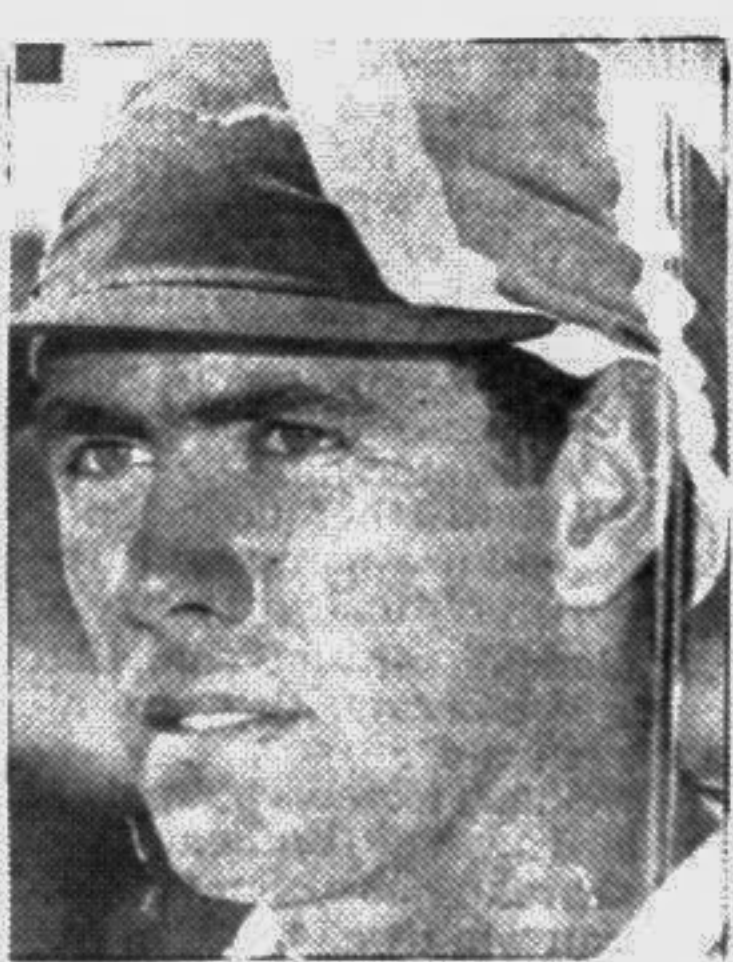
Cronje, however, they were in much better shape when rain rendered the field unplayable and reduced the opening day of the three-day fixture by 24 overs.