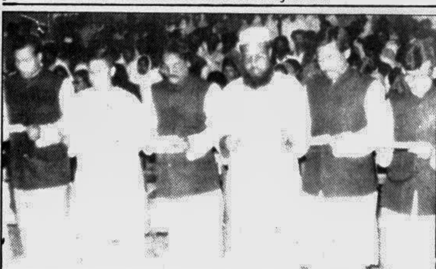
JESSORE: Newly-elected union parishad (UP) chairmen and members in Chowgachha thana of the district recently taking oath at local thana parishad auditorium.

They also told, there are instances where police have submitted final report of murder cases resulting in short-cut trial. In many cases complainants remain silent.