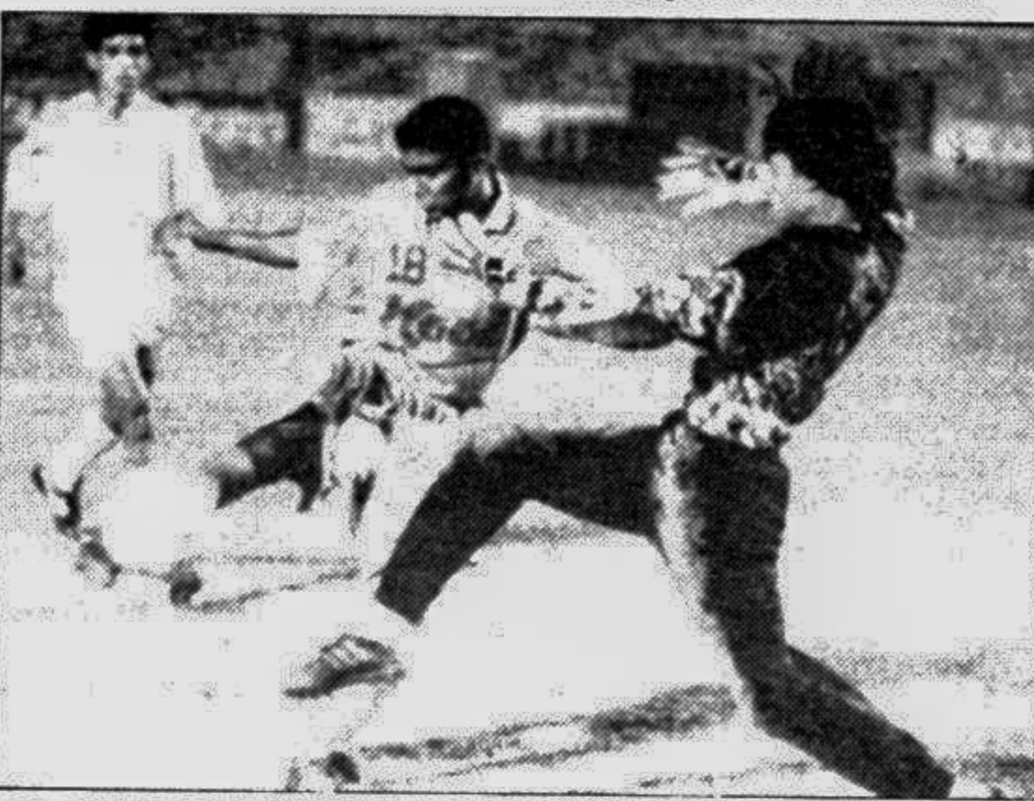
Action from yesterday's Premier Division football super league clash between Abahani Krija Chakra and Farashganj Sporting Club at the Mirpur Stadium.

Earlier, in the day's first match, a First Division relegation league affair, Shantinagar Club and Dhanmondi Club shared points to a 1-1 draw.