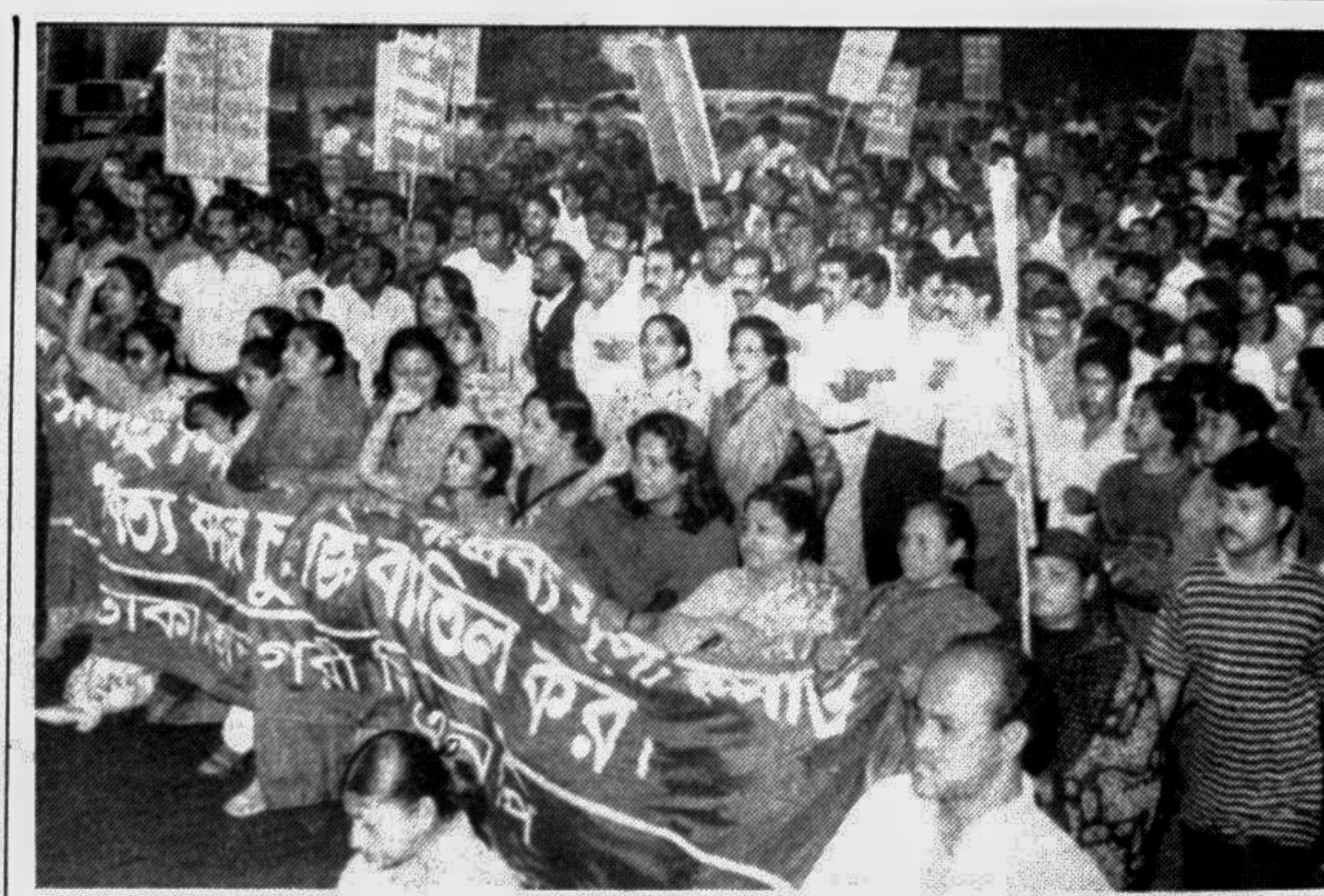
BNP brought out a procession in the city yesterday demanding cancellation of the CHT accord and protesting the price hike of essentials.