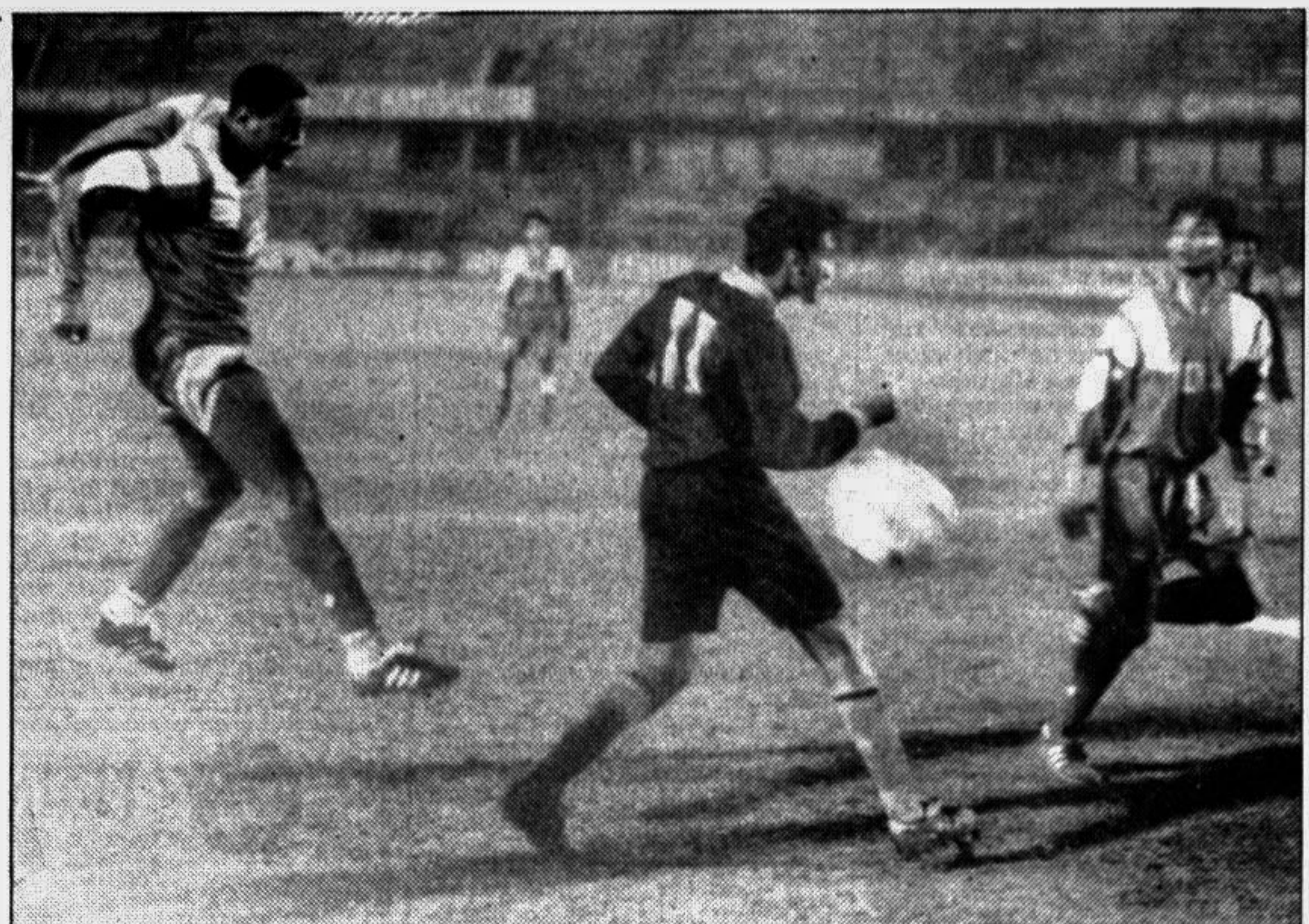
Action from yesterday's Premier Division football league match between Muktijoddha and Brothers Union at the Mirpur Stadium. Muktis won 3-1.

Elsewhere British triple-jumpers Jonathan Edwards and Ashia Hansen both set national records on their way to victories that augur well for the European indoor championships in Valencia later this month.