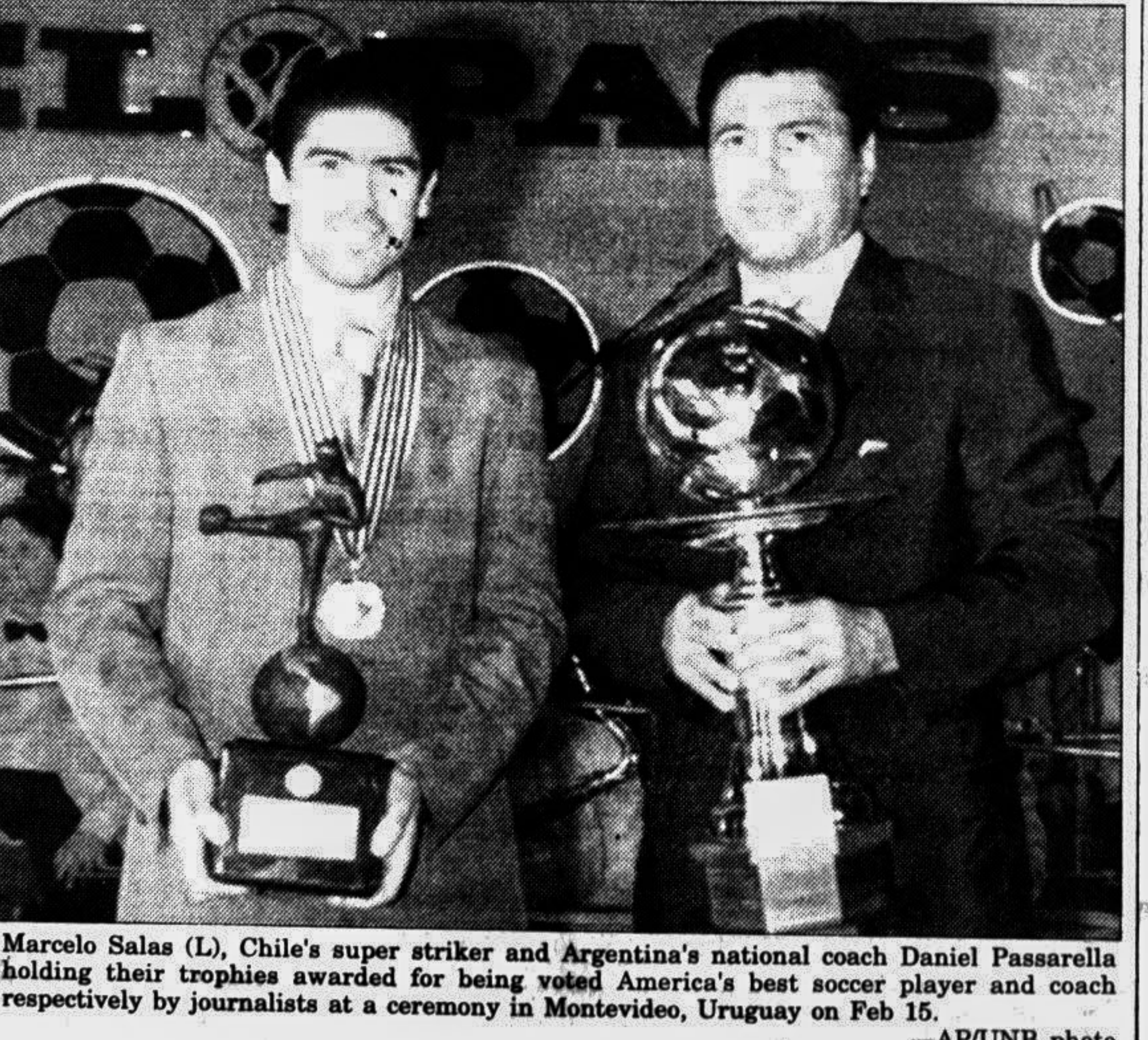
Marcelo Salas (L), Chile's super striker and Argentina's national coach Daniel Passarella holding their trophies awarded for being voted America's best soccer player and coach respectively by journalists at a ceremony in Montevideo, Uruguay on Feb 15.

In other matches Athletic Bilbao crashed to a shock 3-0 home defeat against Valencia whose scorers were Ilic (37, 55) and Mendieta (75), and Celtic Vigo beat Real Sociedad 2-1 thanks to goals from Djorovic (42) and Revivo (86).