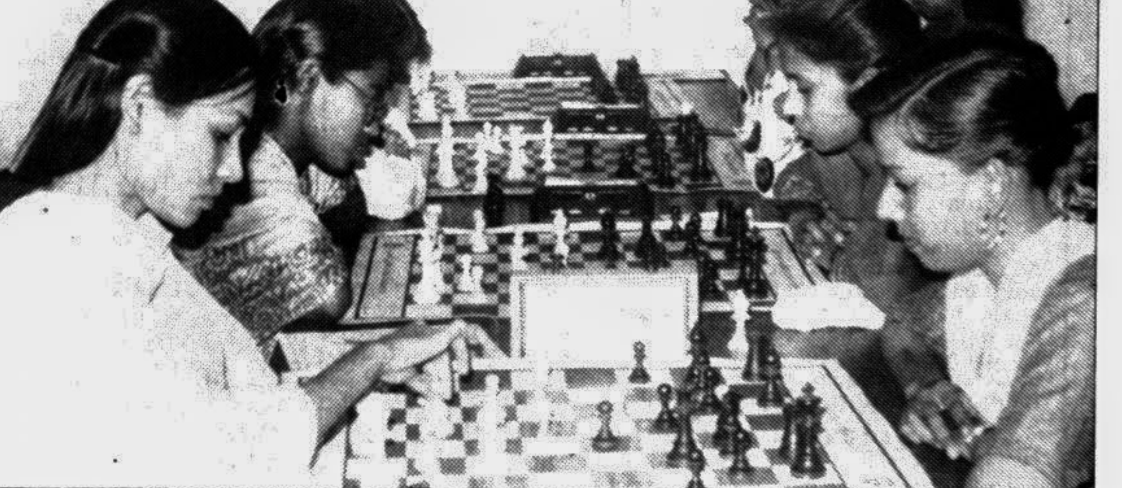
Scene from the third round engagements of the 19th national women's chess qualifiers at the NSC yesterday.

Another problem for Pakistan has been the neck injury to captain Rashid Latif that knocked him out of the first Test and will require surgery that will keep him from playing for three weeks.