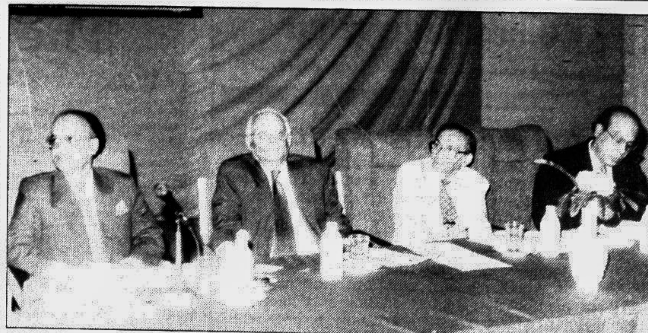
ASHK Sadique, Minister for Education, addressing as chief guest an open discussion on national education policy yesterday organised by the Bangladesh University Parishad at the Teachers-Students Centre auditorium of the Dhaka University.