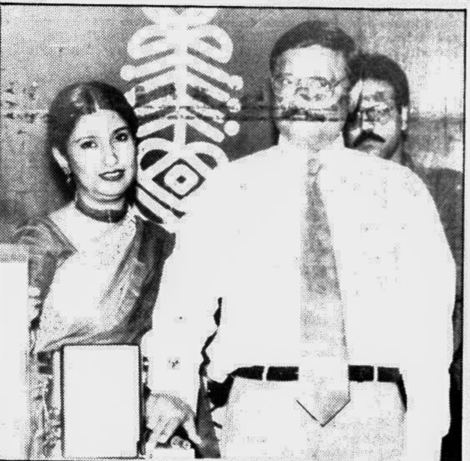
A solo recitation of poems by Nima Rahman on audio-cassette was launched at the National Museum auditorium in the city recently. State Minister for Youth, Sports and Culture Obaidul Quader launched the cassette.

Police detained 105 people from different parts of the city on various charges in last 24 hours till 6 am yesterday, reports UNB.