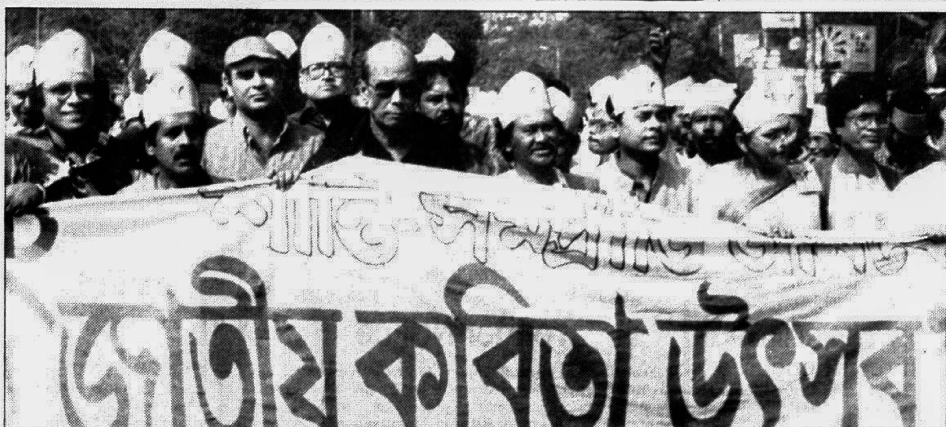
Jatiya Kabita Parishad brought out a procession in the city yesterday.