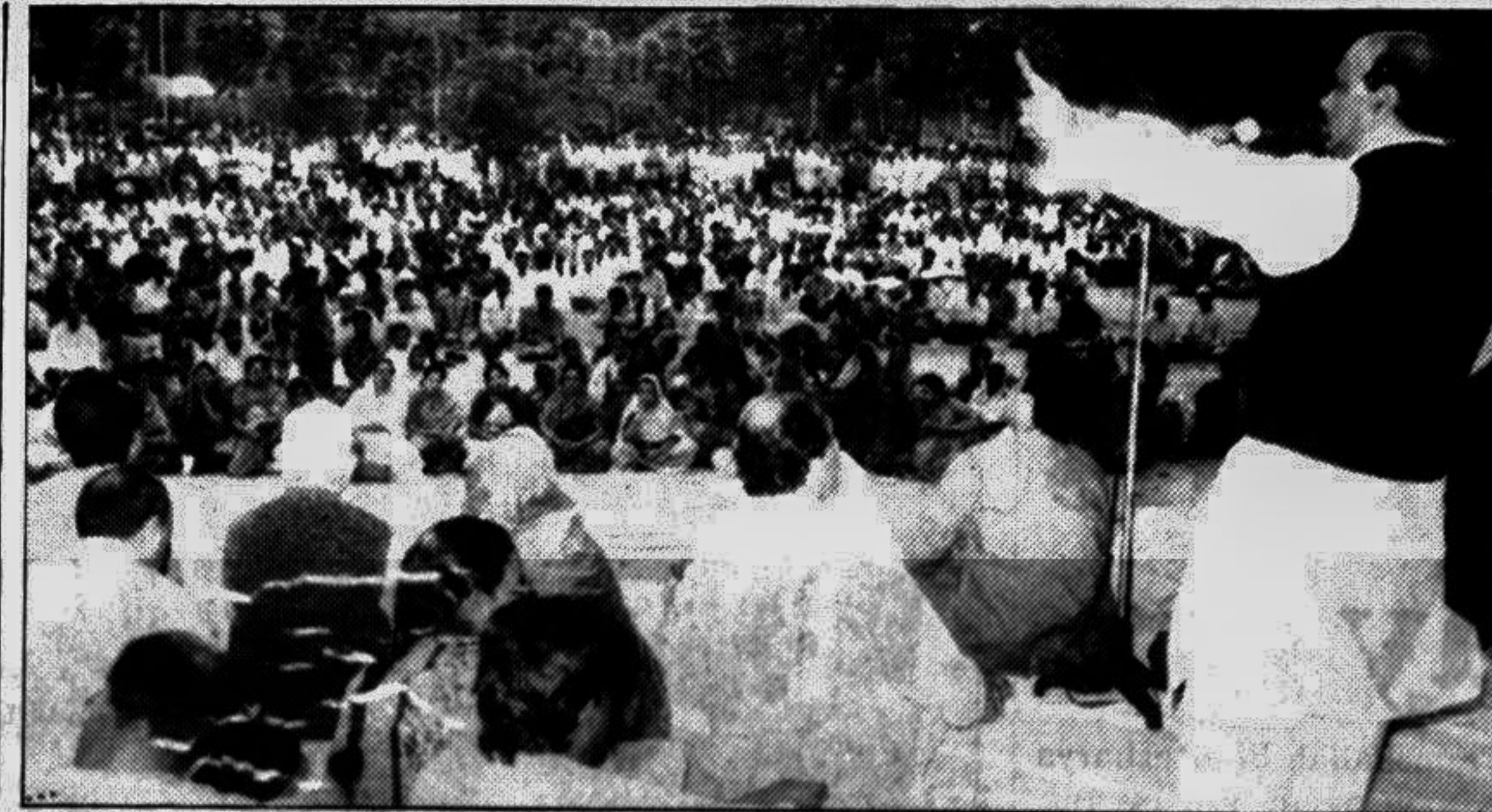
Post and Telecommunications Minister Mohammad Nasim Addressing a rally organised by city Awami League marking 'Democracy Killing Day', at Ramna Batamul yesterday.