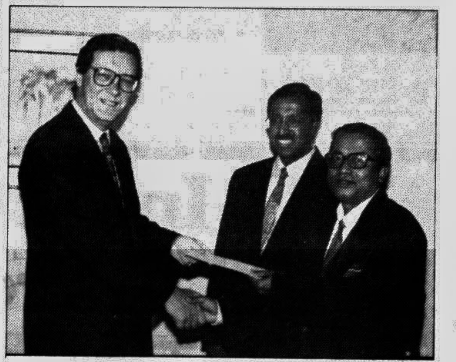
Australian Foreign Minister Alexander Downer, during his recent visit to Bangladesh presented a cheque for 78000 AUD for upgradation of OT facilities of Dhaka Dental College.

Quran Khawani and milad mahfil will be organised at the 59/1 Issa Khan Road, DU teachers' quarters after Asr prayers.