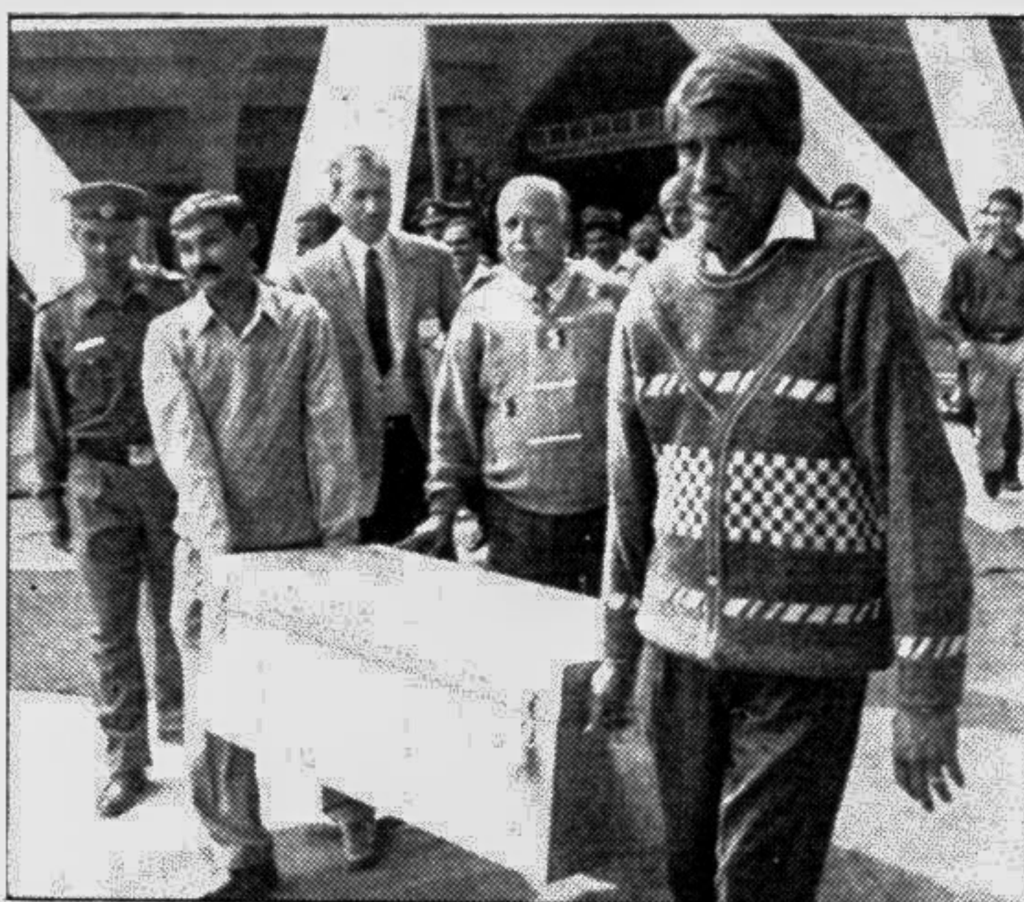
Workers and officials carrying election materials in an iron box for distribution among officials in New Delhi yesterday.

MADRAS, Feb 14: Thirteen explosions rocked a town in south India today, killing at least 32 people, shortly before a Hindu nationalist leader was scheduled to address an election rally, AP quoting police said.