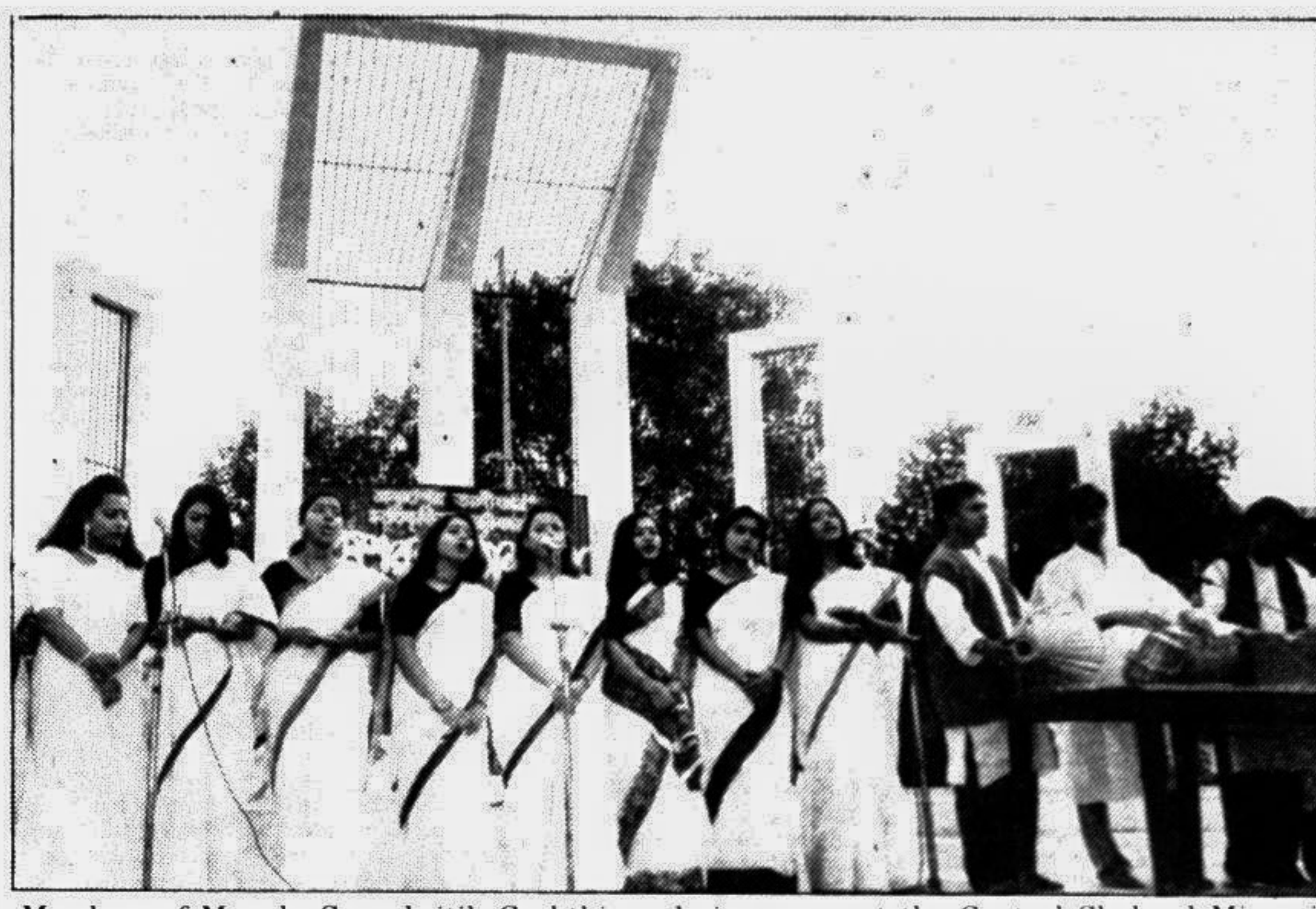
Members of Manglu Sangskritik Goshthi rendering songs at the Central Shaheed Minar in the city yesterday as part of the Amar Ekushey programme.