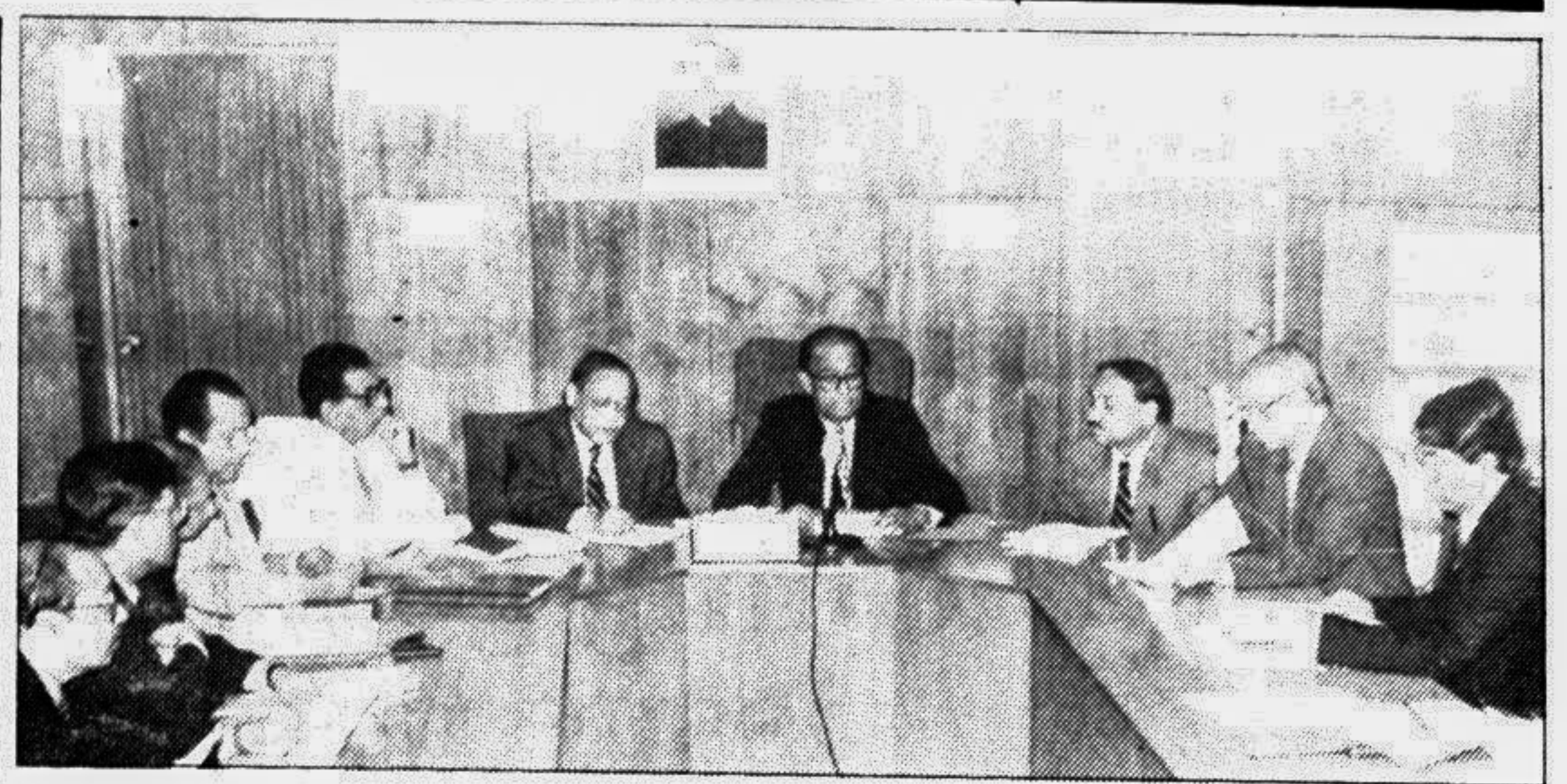
Salahuddin Yusuf, Minister for Health and Family Welfare, presiding over the first meeting of the National Population Formulation Committee at the conference room of the ministry yesterday.

Some 100 students and unemployed youths are taking part in the programme.