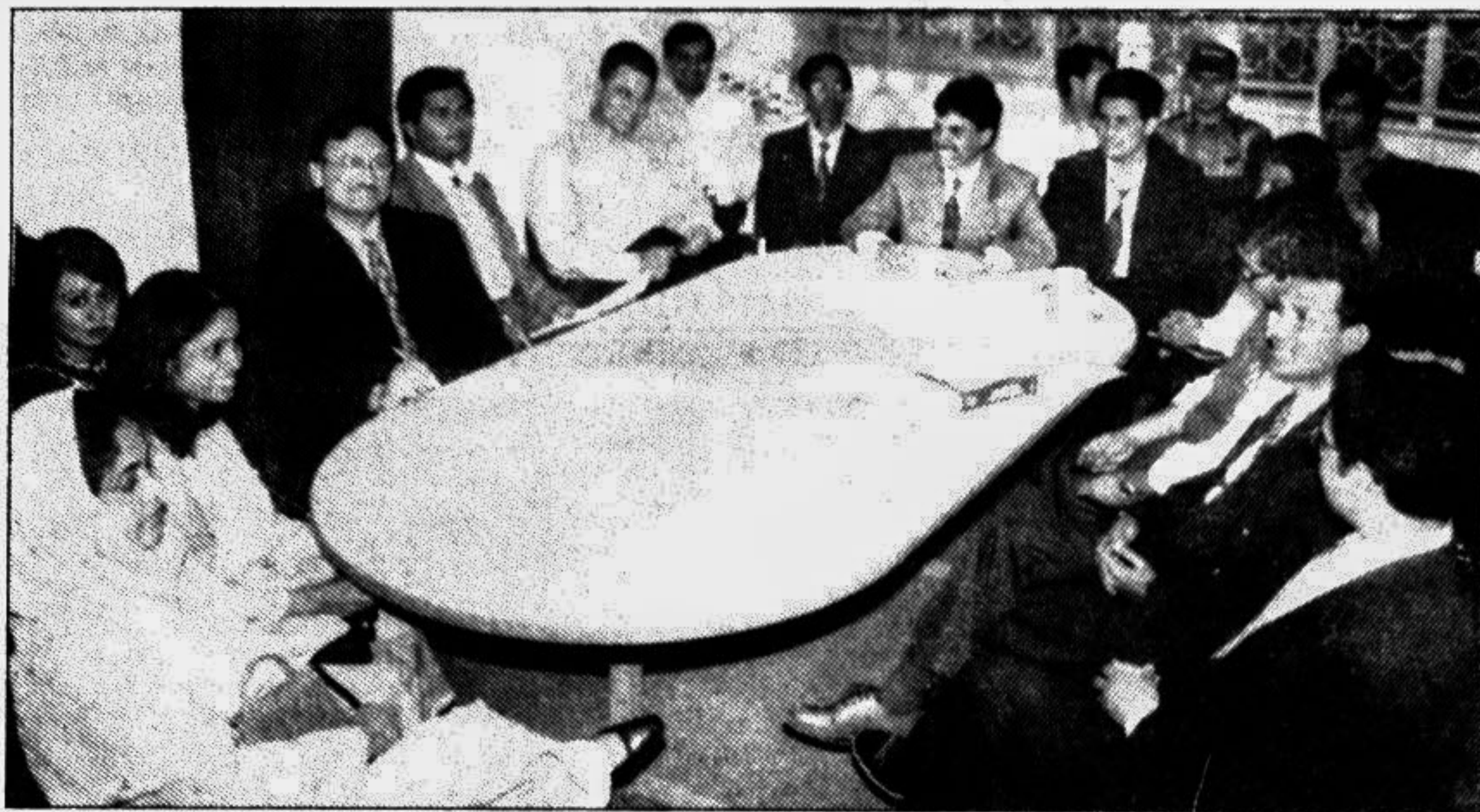
Young lawyers under The Daily Star programme of 'Entrepreneurs and professionals speak out' met yesterday to chalk out their follow-up programmes, which include strengthening of professional ethics, bringing about transparency and accountability of our legal system and improving the professional status of the young legal practitioners. They have formed three groups which will study the above issues and report within a week. The picture shows the meeting in progress held in collaboration with the British Council at its premises in Dhaka.

Apart from display and sale of different kinds of handicraft and cottage industries products there will be sessions of Bhaavata, Bhatiali, Lalon geeti, Zare, Shari songs. The fair will remain open from 4 pm to 9 pm Saturday to Thursday and from 10am to 9 pm on Friday.