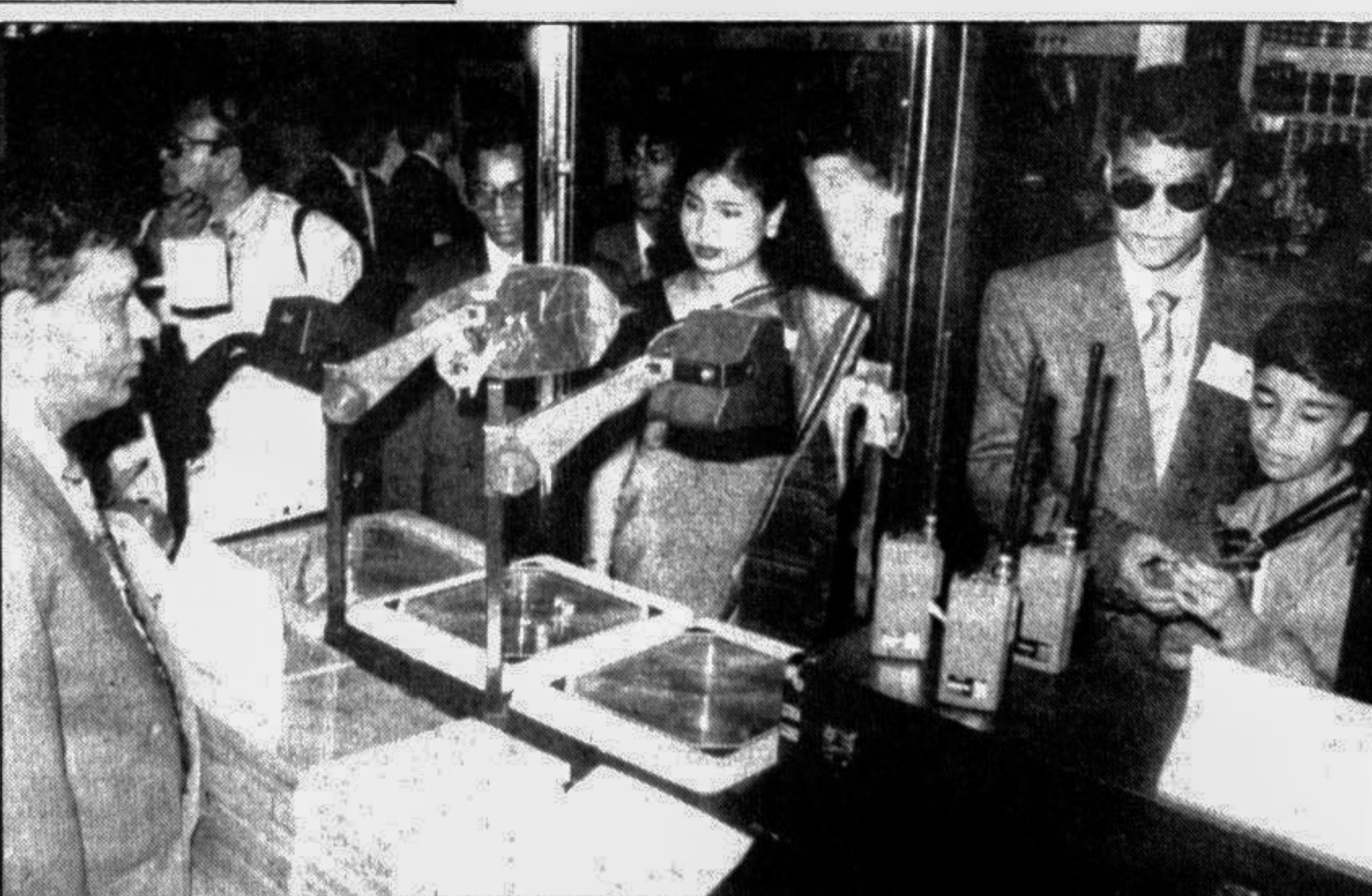
Visitors at a stall in the US Trade Show that began at Sheraton Hotel in the city yesterday.