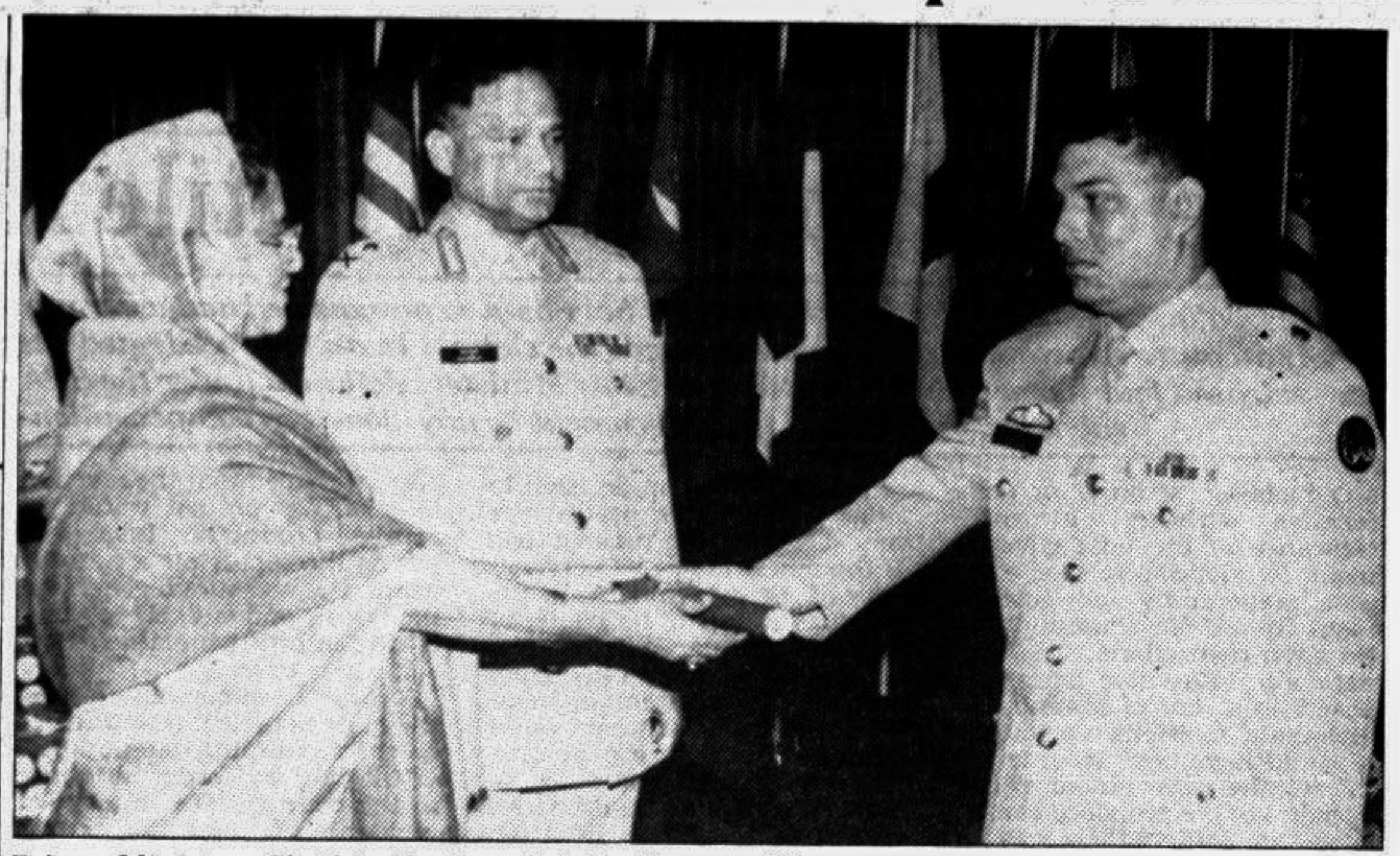
Prime Minister Sheikh Hasina distributing certificates among the graduates at the graduation ceremony of 22nd Army Staff Course, 16th Naval Staff Course and 18th Air Staff Course at the Defence Services Command and Staff College at Mirpur in the city yesterday.