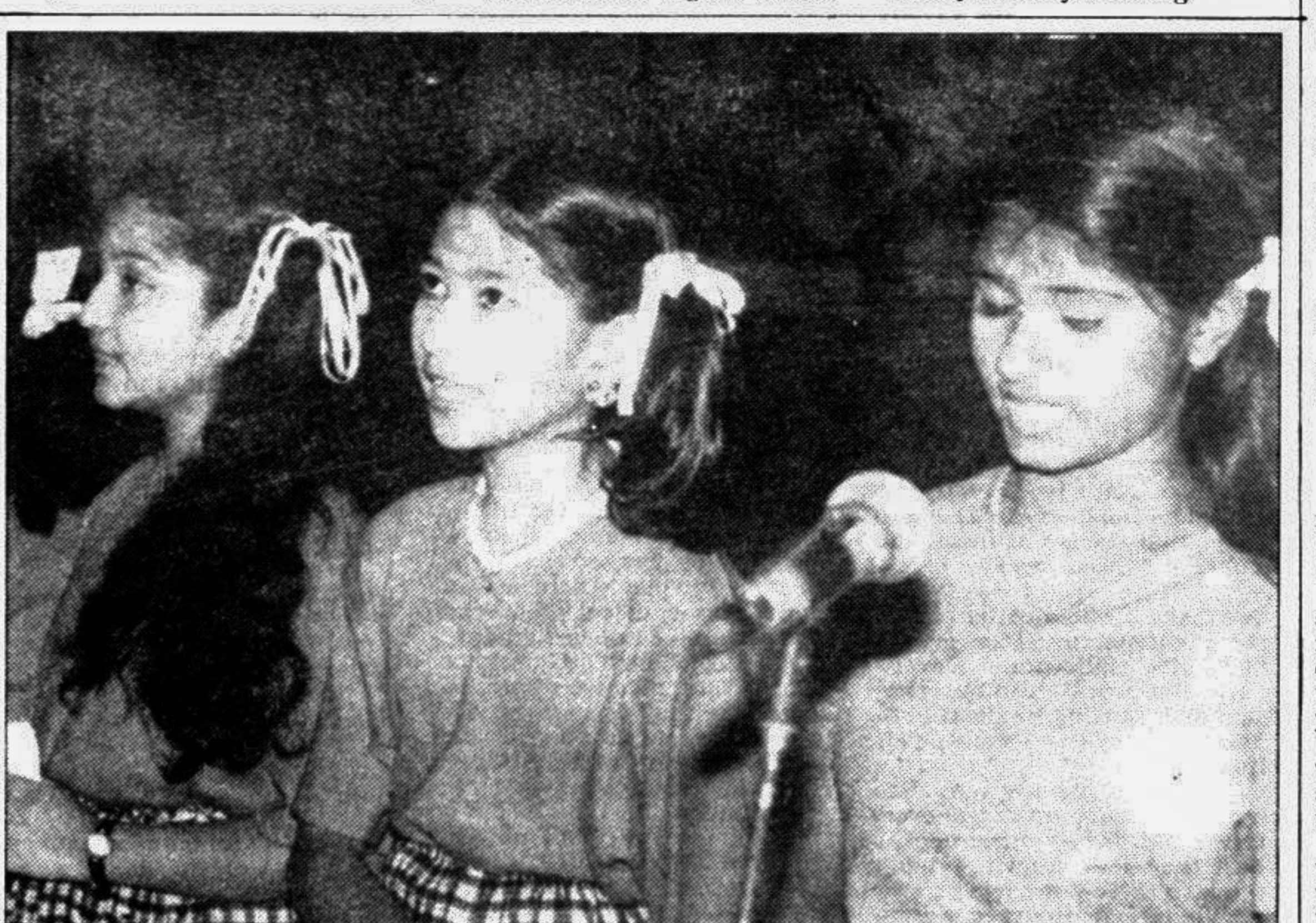
Children rendering a song at the Central Shaheed Minar yesterday, the first day of the 11-day cultural programme organised by Sammilito Sangskritik Jote in observance of Amar Ekushey.