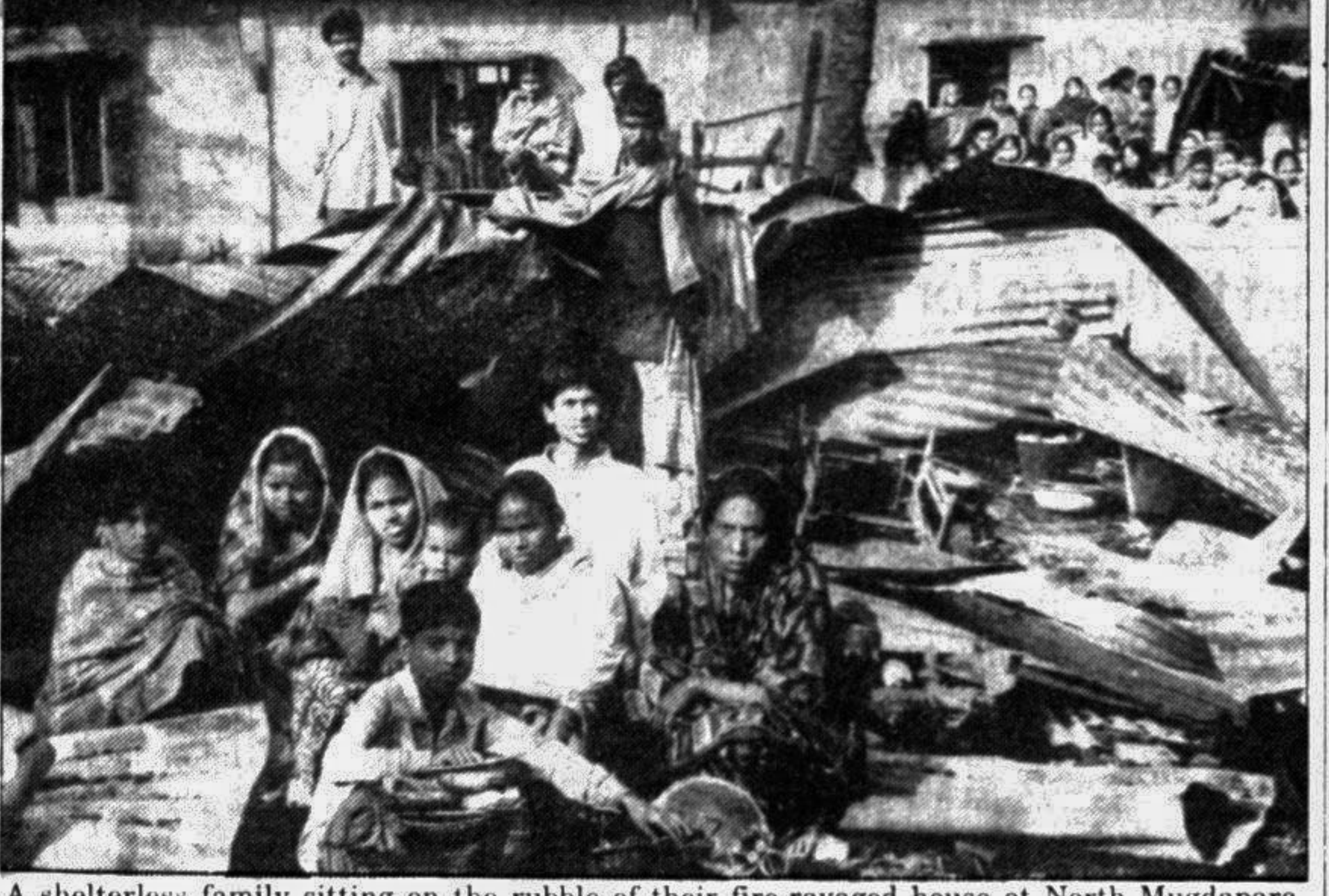
A shelterless family sitting on the rubble of their fire-ravaged house at North Muggdapara in the city yesterday. About 100 shanties were gutted in a fire there on Sunday night.