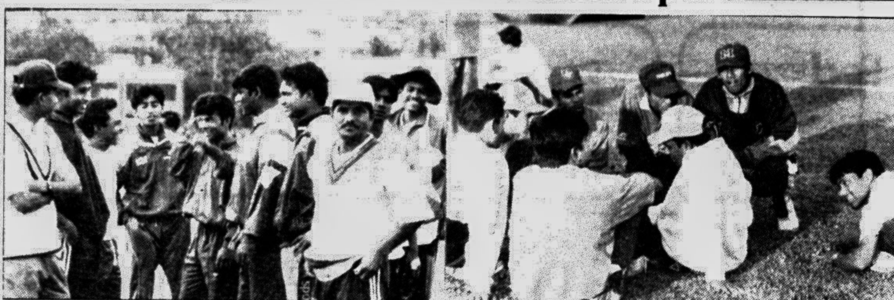
Players of Abahani Krira Chakra (L) and Mohammedan Sporting Club in jovial mood during practice yesterday. The arch-rivals will lock horns today in the Bijoy Dibash cricket tournament final at the Dhaka Stadium.

The mistake has flawed the NIOC's multi-million dollar effort to prevent a recurrence of the numerous glitches that haunted a similar computer network at the Atlanta Summer Games in 1996.