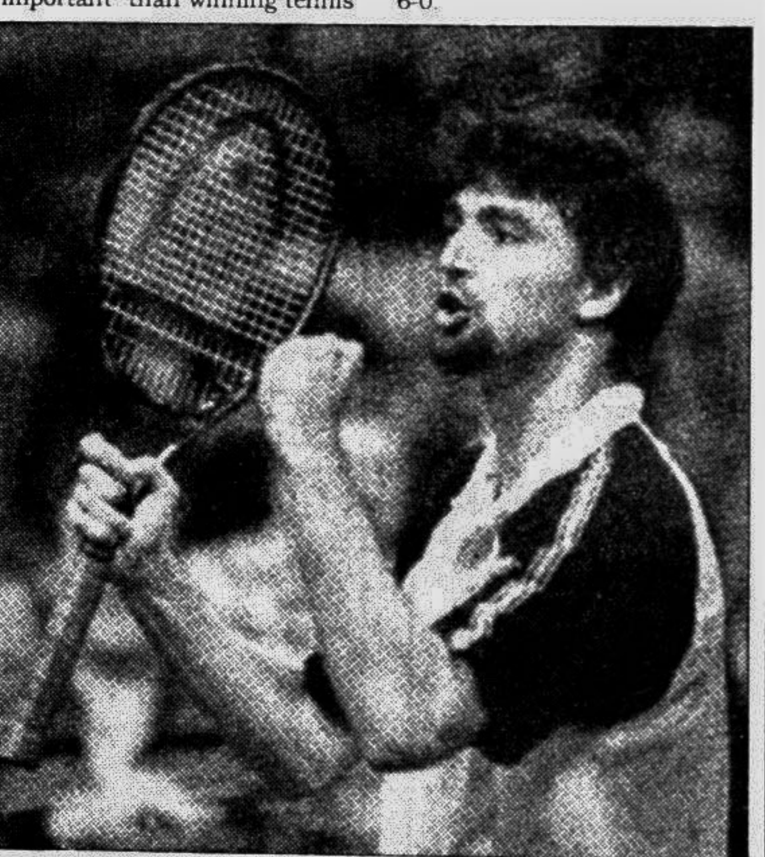
Goran Ivanisevic of Croatia is exultant after his hard fought win over German legend Boris Becker in the Croatian Indoors in Split on Feb 5. Ivanisevic prevailed 7-6, 6-7, 6-4.