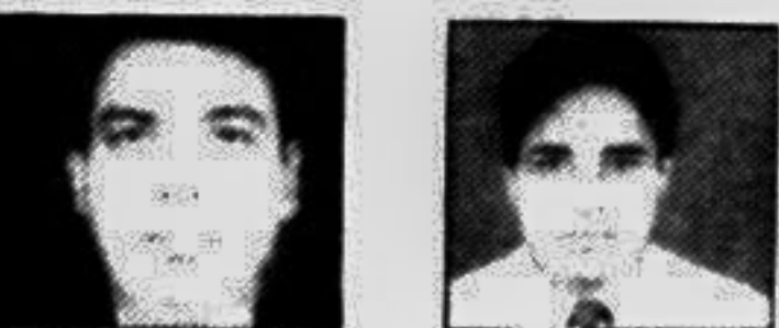
President Gen Secy

Six chairmen and 72 members from six different Union Parishads under Ishurdi thana participated in the oath taking function.