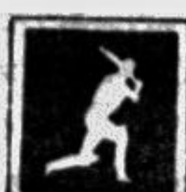
ADELAIDE, Feb 3: Controversy marred the drawn third cricket Test between Australia and South Africa on Tuesday after skipper Hansie Cronje felt the home side's