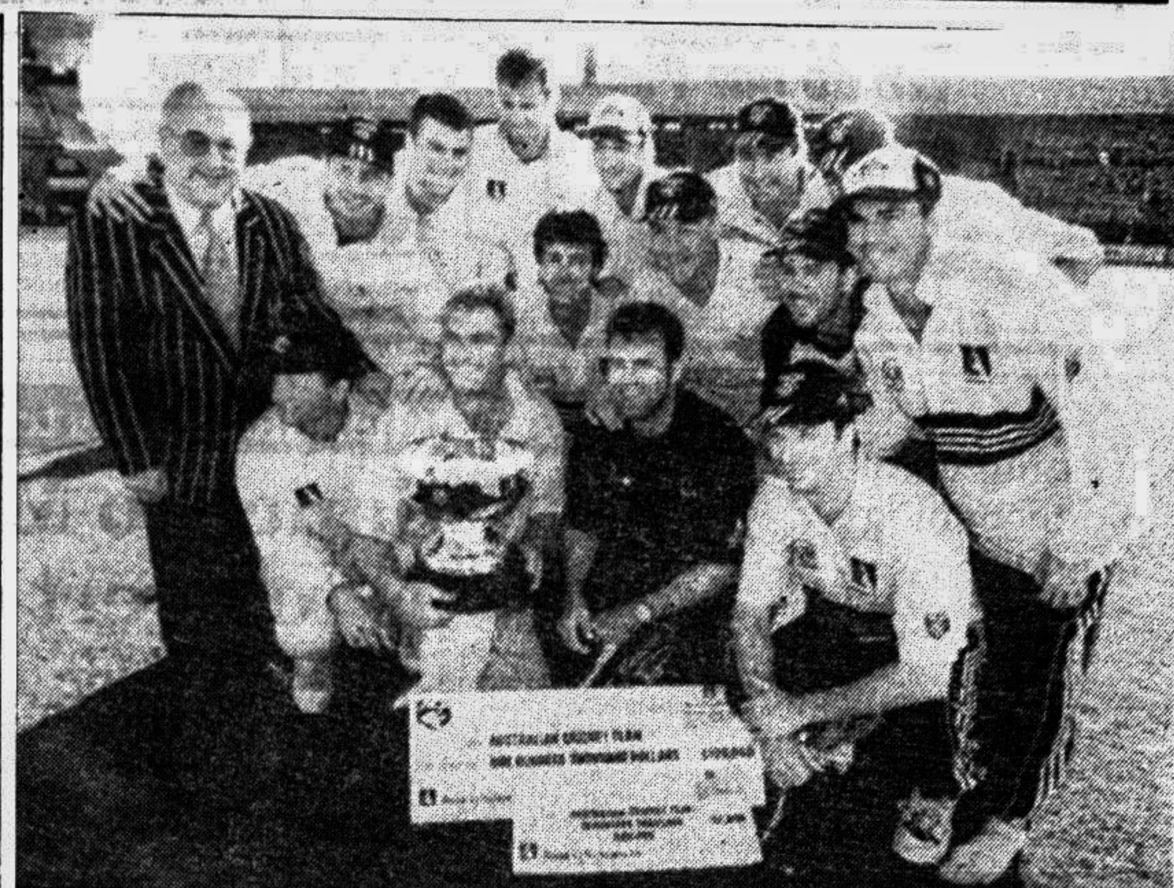
CHAMPION UNIT: Jubilant Australian cricketers huddle together after their Test series victory over South Africa at Adelaide yesterday.

A field of 28 will take part in the competition, vying for the winner's check of $50,000 dollars on the artificial indoor courts at the Tokyo metropolitan gymnasium.