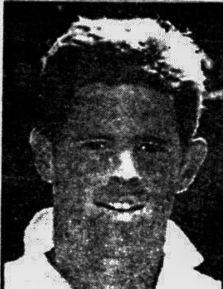
POLLOCK ... p-o-m

Mark Waugh should have been given out hit wicket, reports AP. Waugh scored a match-saving unbeaten 115 and shared a nervous 24 minutes with Shane Warne to force the dramatic draw and win the series 1-0.