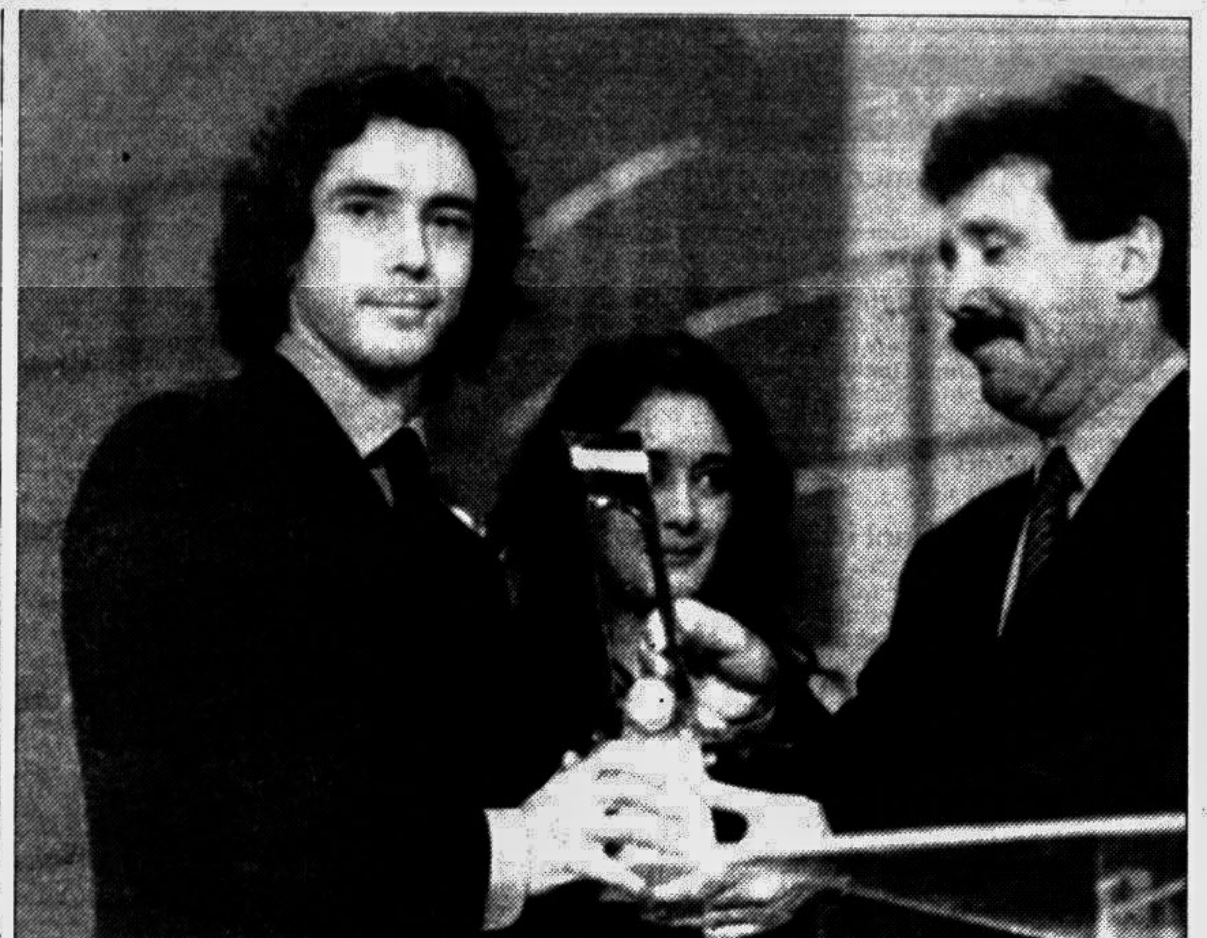
Portuguese international Paulo Sousa (L) receives the award for being the best Portuguese soccer player of the 96/97 season from national team coach Humberto Coelho in Lisbon on Feb 2.

Each team plays its three opponents once on a league system with three points for a win and one for a draw and group winners and runners-up advance to the quarterfinals.