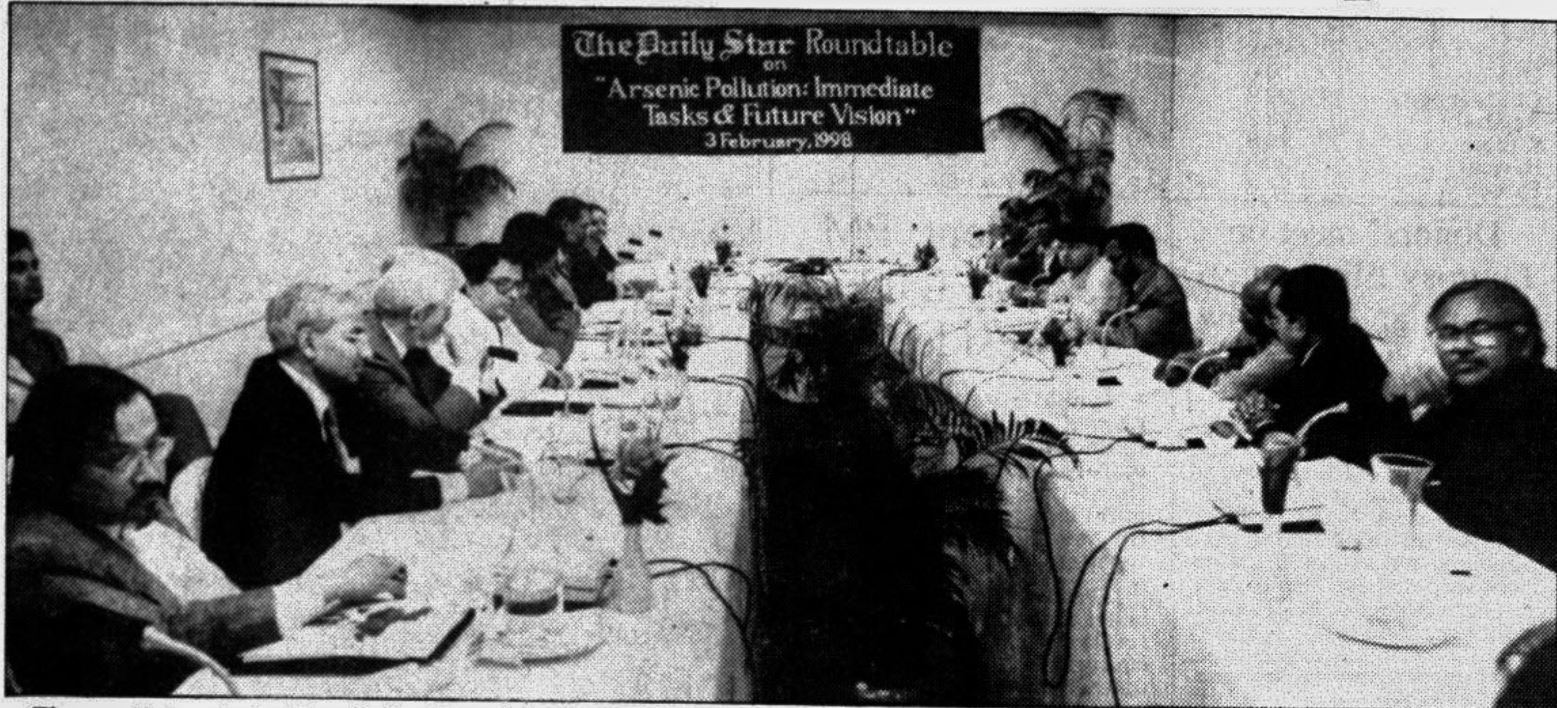
The participants in The Daily Star Roundtable on 'Arsenic Pollution: Immediate Tasks and Future Vision' at Hotel Sheraton yesterday.

"Policymakers are responsible for today's fate of ground water arsenic contamination," See page 12 Col 2