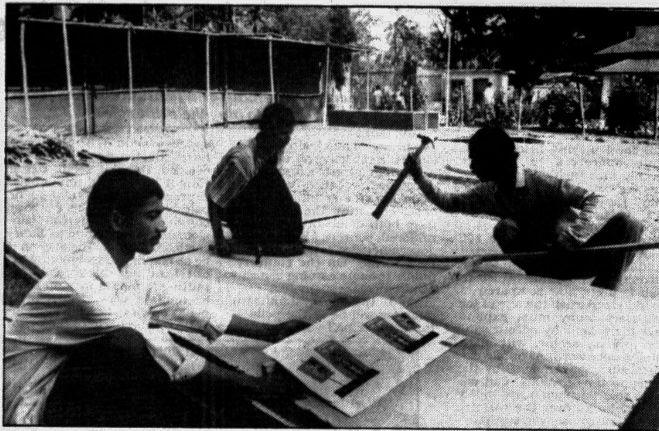
Work on stalls for the Bangla Academy Boi Mela '98, which begins from Feb 7, is going on in full swing on the Academy premises in the city.