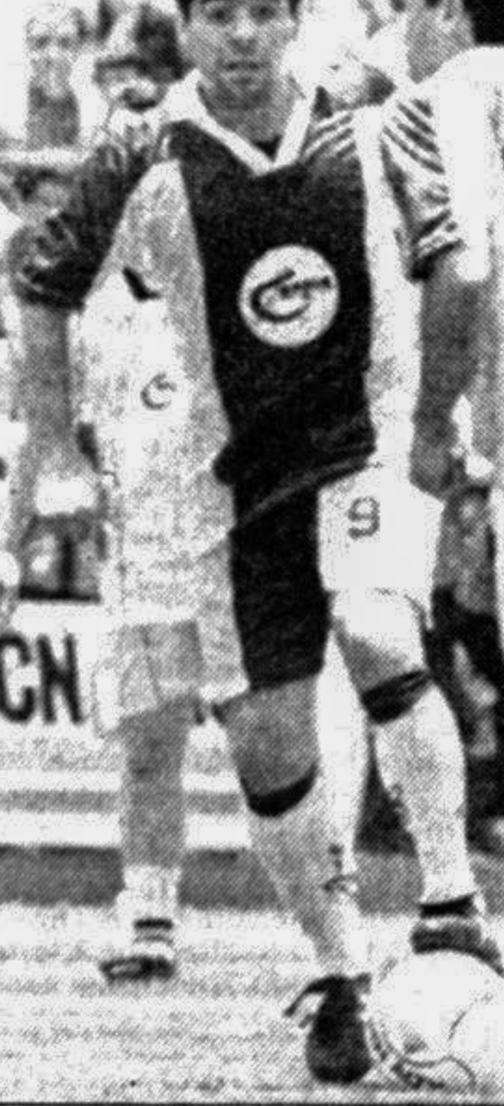
NOSTALGIC: Argentine superstar Diego Maradona (L) and former Brazilian striker Careca (R) teamup during an exhibition match organised on the occasion of the opening of a soccer school owned by Careca in Campinas, Brazil on Jan 31. The duo together performed with aplomb for Serie A side Napoli in the late 80s.

ARGENTINA: Diego Maradona (L) and former Brazilian striker Careca (R) teamup during an exhibition match organised on the occasion of the opening of a soccer school owned by Careca in Campinas, Brazil on Jan 31. The duo together performed with aplomb for Serie A side Napoli in the late 80s.