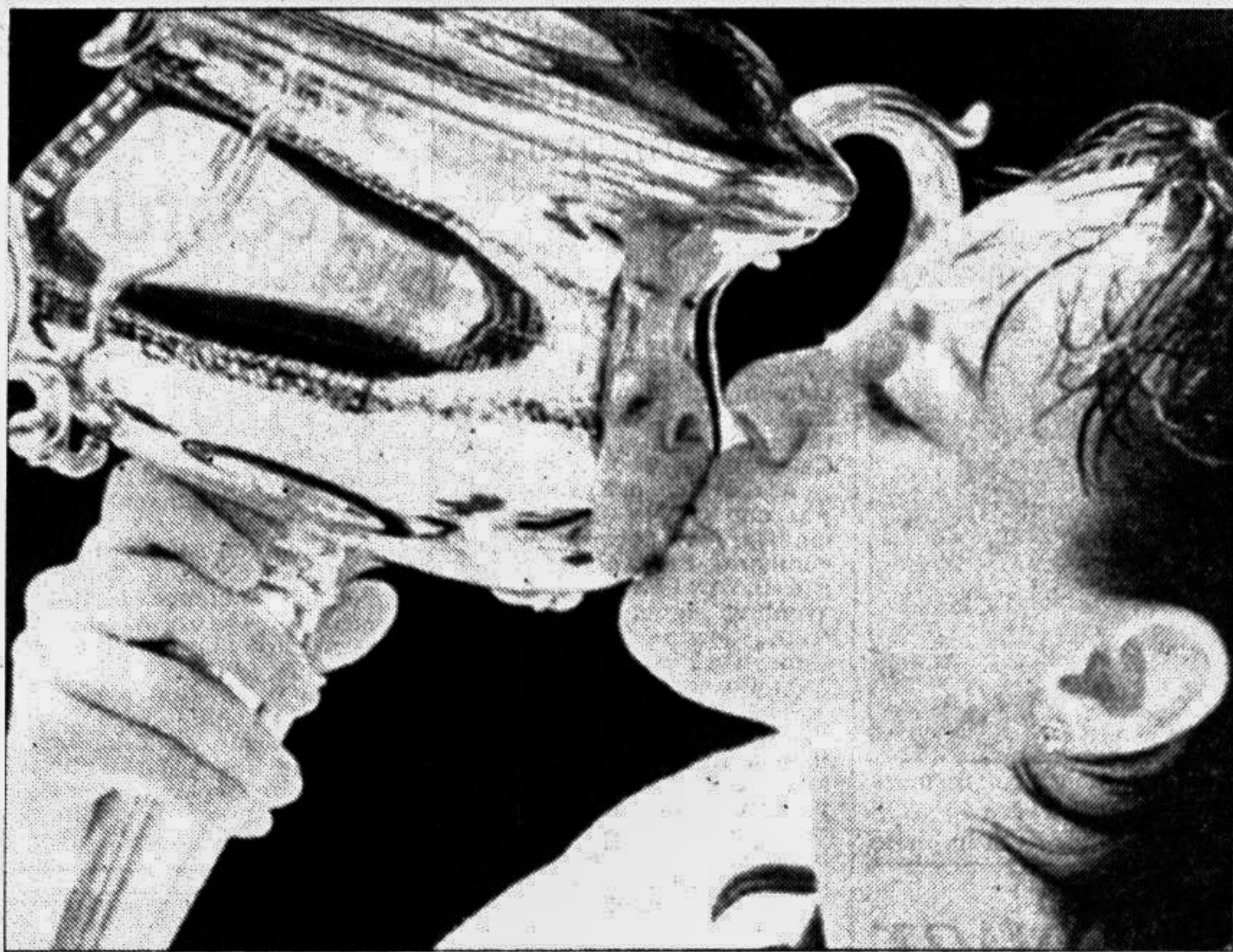
WONDER WOMAN: Martina Hingis plants a kiss on the Aussie Open singles trophy after her victory over Conchita Martinez in the final at Melbourne on Jan 31.