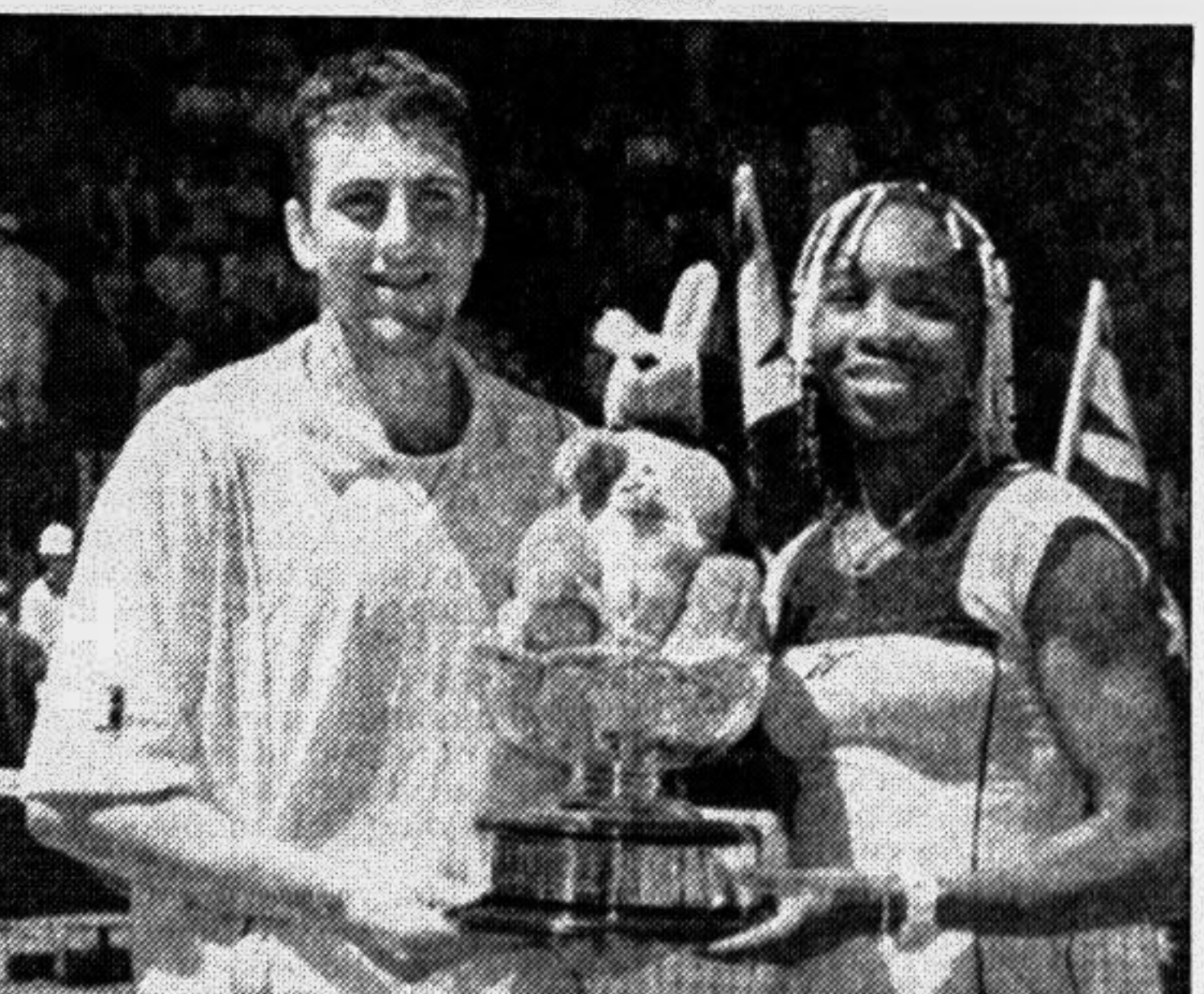
Australian Open mixed doubles champions Venus Williams (R) and Justin Gimelstob display their prized possession after a 6-2, 6-1 triumph over Slovaks Helena Sukova and Cyril Suk in the final at Melbourne yesterday.

The extent of the challenge posed by fellow teens she can assess from having played them so often. Graf and Seles are unknown quantities now and means that Hingis cannot afford to feel that she is unsinkable.