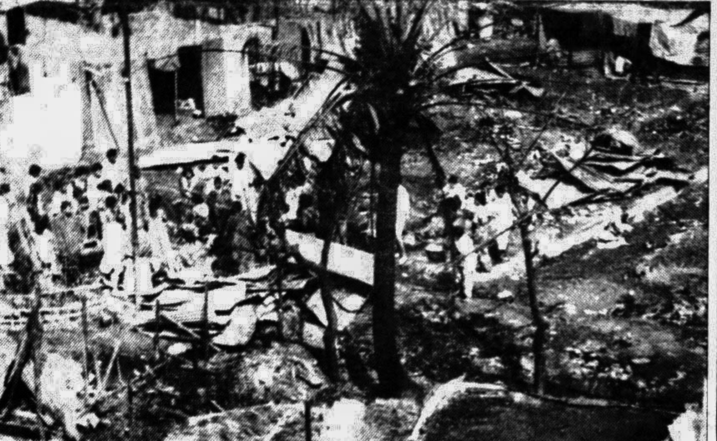
The fire ravaged slum at Postagola in the city.