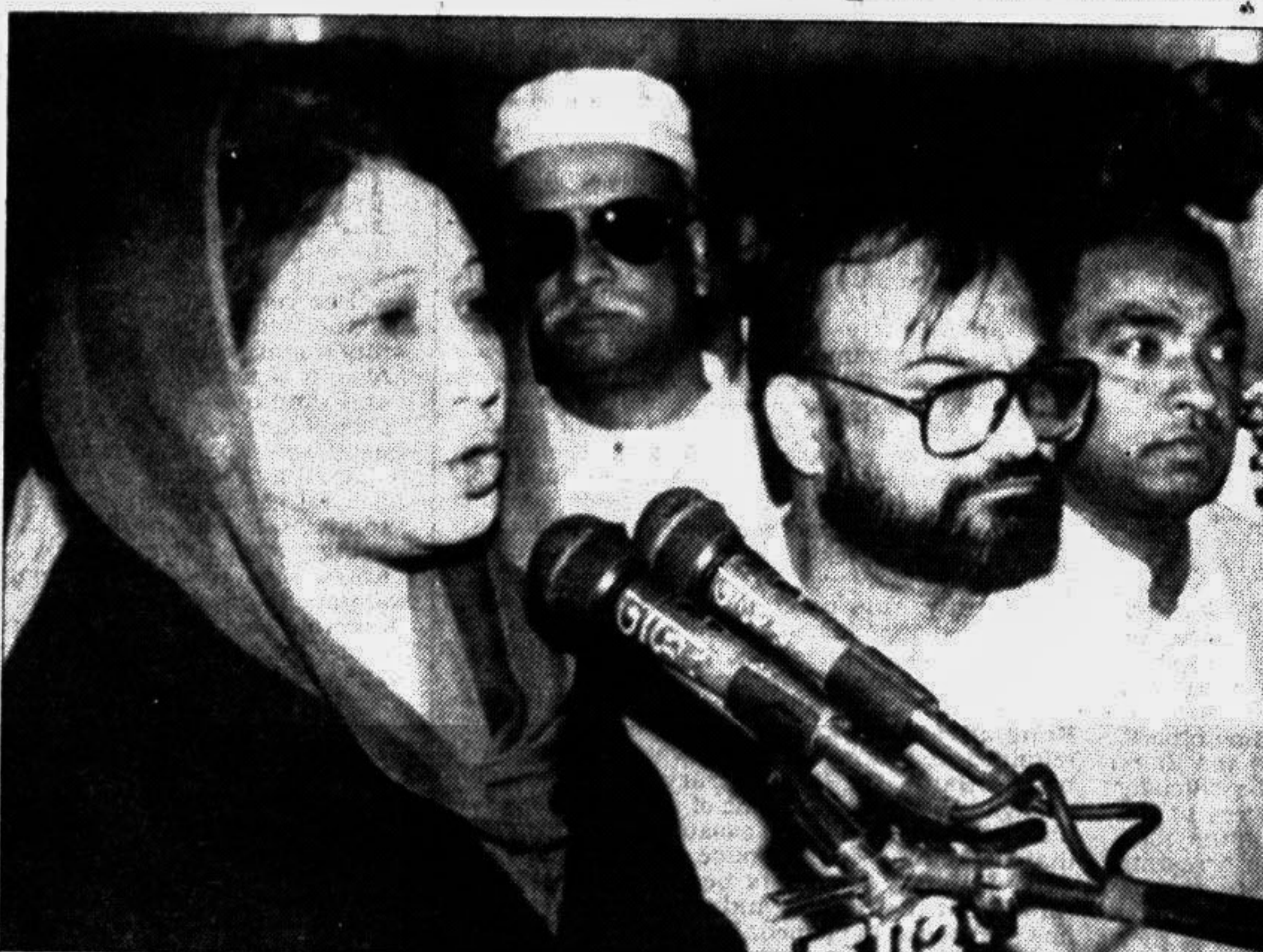
The Leader of the Opposition in Parliament and BNP Chairperson Begum Khaleda Zia addressing the discussion meeting at Kabi Nazrul College premises yesterday organised by Kotwali Thana BNP and its front organisations.

They will meet the Foreign Minister, Finance Minister, Law Minister, BNP Chairperson Begum Khaleda Zia and Jatiya Party Chairman HM Ershad.