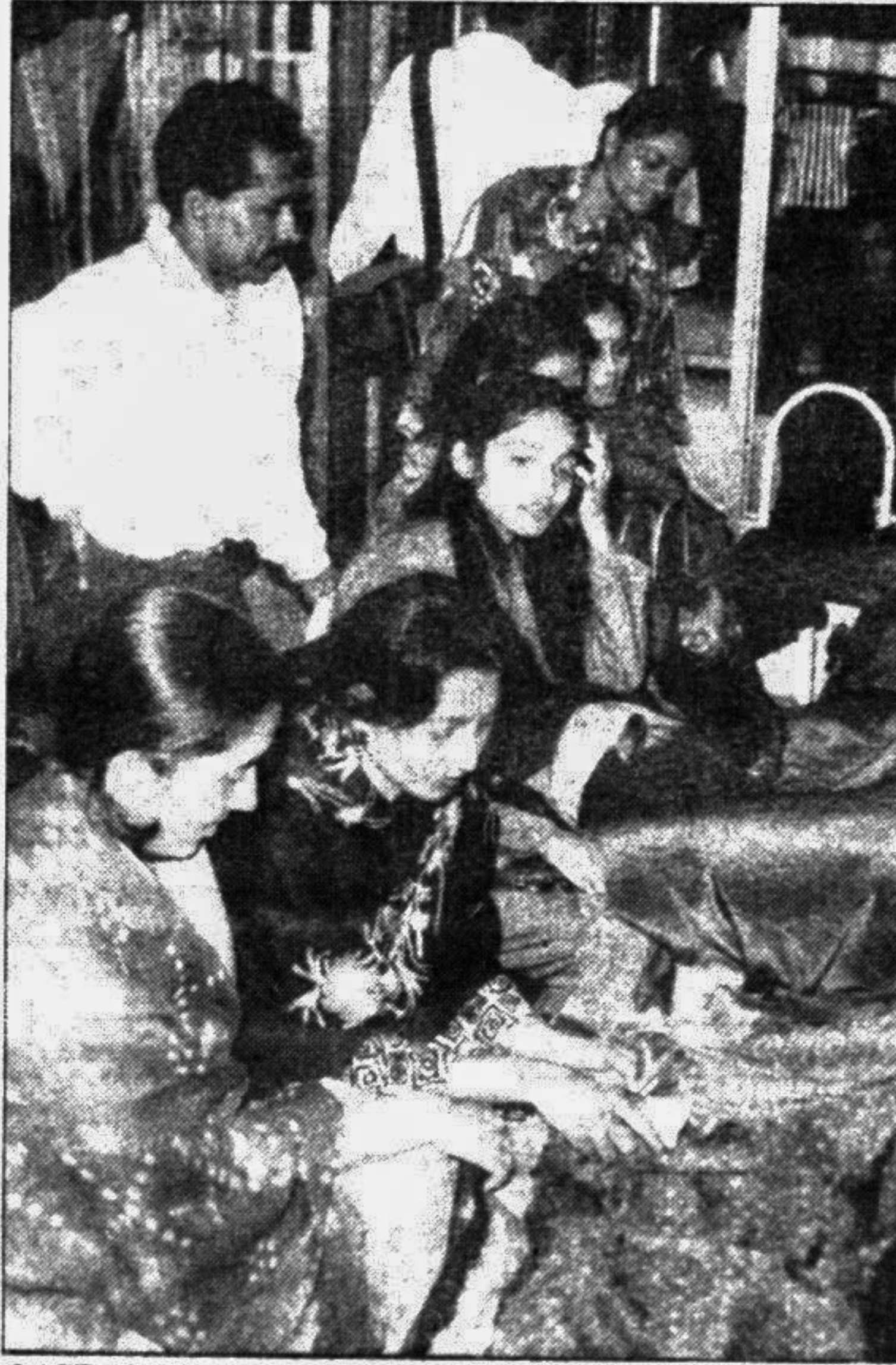
LAST-MINUTE SHOPPING: Eid shoppers choosing saris at a shop in Ghatish Market in the city yesterday.

Muslims across the country will celebrate the holy Eid-ul-Fitr with due solemnity and religious fervour tomorrow subject to sighting of the Shawal moon today, report agencies. A meeting of the National Moon Sighting Committee will be held today at 6 pm at the head office of Islamic Foundation Bangladesh in the city. If the Shawal moon is sighted anywhere in Bangladesh, persons sighting the moon have been urged to contact the committee over telephone — 9559493, 9555951, 9555947, 9550280, 9559643, 9556407, 9558337 — or fax 9563397. The celebration of Eid will mark the end of a month-long fasting during the holy Ramadan. This is one of the greatest religious festivals of the Muslim community. President Justice Sha-