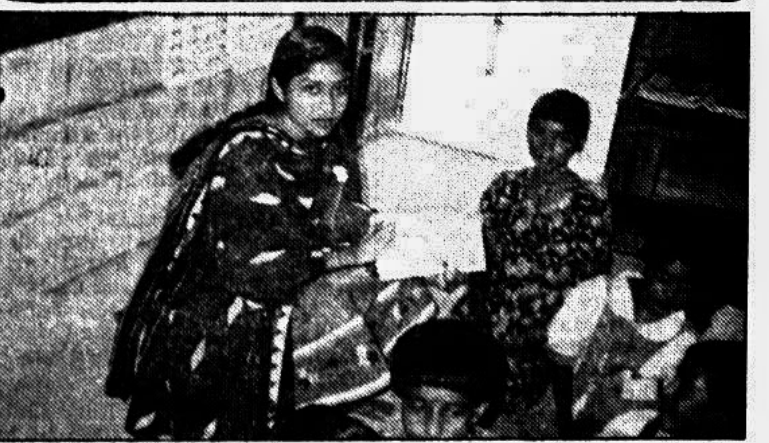
MYMENSINGH: Study in progress at a primary school being run in the town by Gano Sahajyo Sangstha, a non-governmental organisation (NGO).