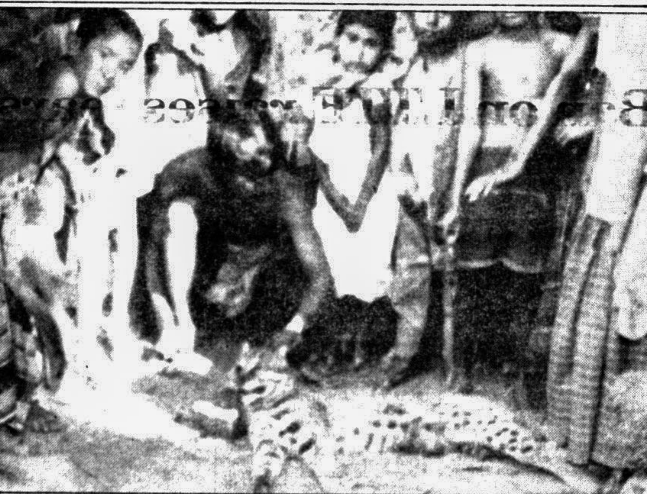
JHENIDAH: This female fishing cat was beaten to death by people at village Pukuria under Kaliganj thana on January 23.

The source, however, said, some native and foreign owned tea gardens under Kamalgonj and Srimongal thanas are realizing their land revenue on regular basis. But other gardens are showing less interest to pay land revenue.