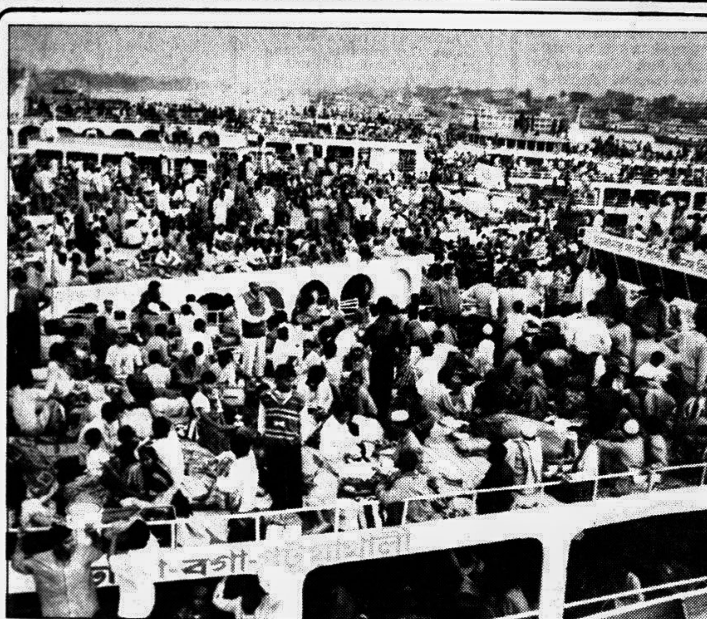
Launches packed with home-bound people at the Sadarghat terminal in the city yesterday, two days ahead of Eid-ul-Fitr.