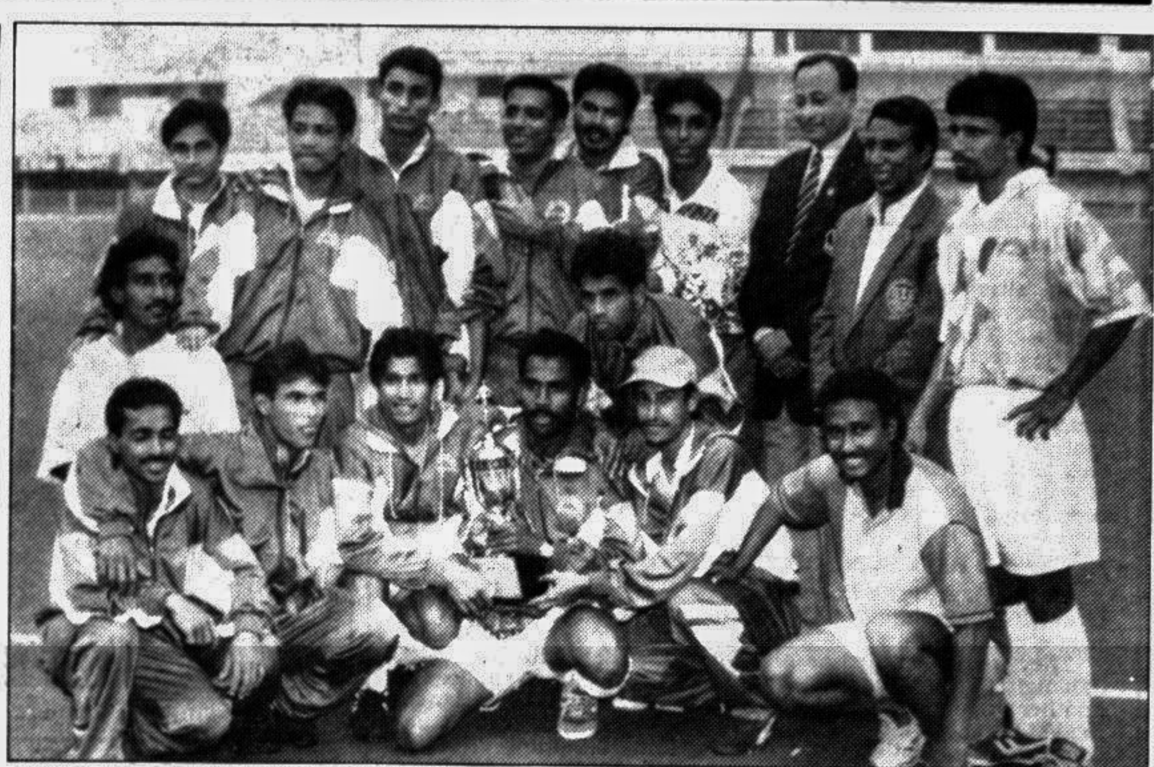
Players and officials of Dhaka DSA who won the national hockey championship defeating Dhaka University in the final yesterday.

MELBOURNE, Jan 26: Soccer Australia chairman David Hill and national coach Terry Venables will meet later this week to discuss the former England mentor's future in Australia, reports AP.