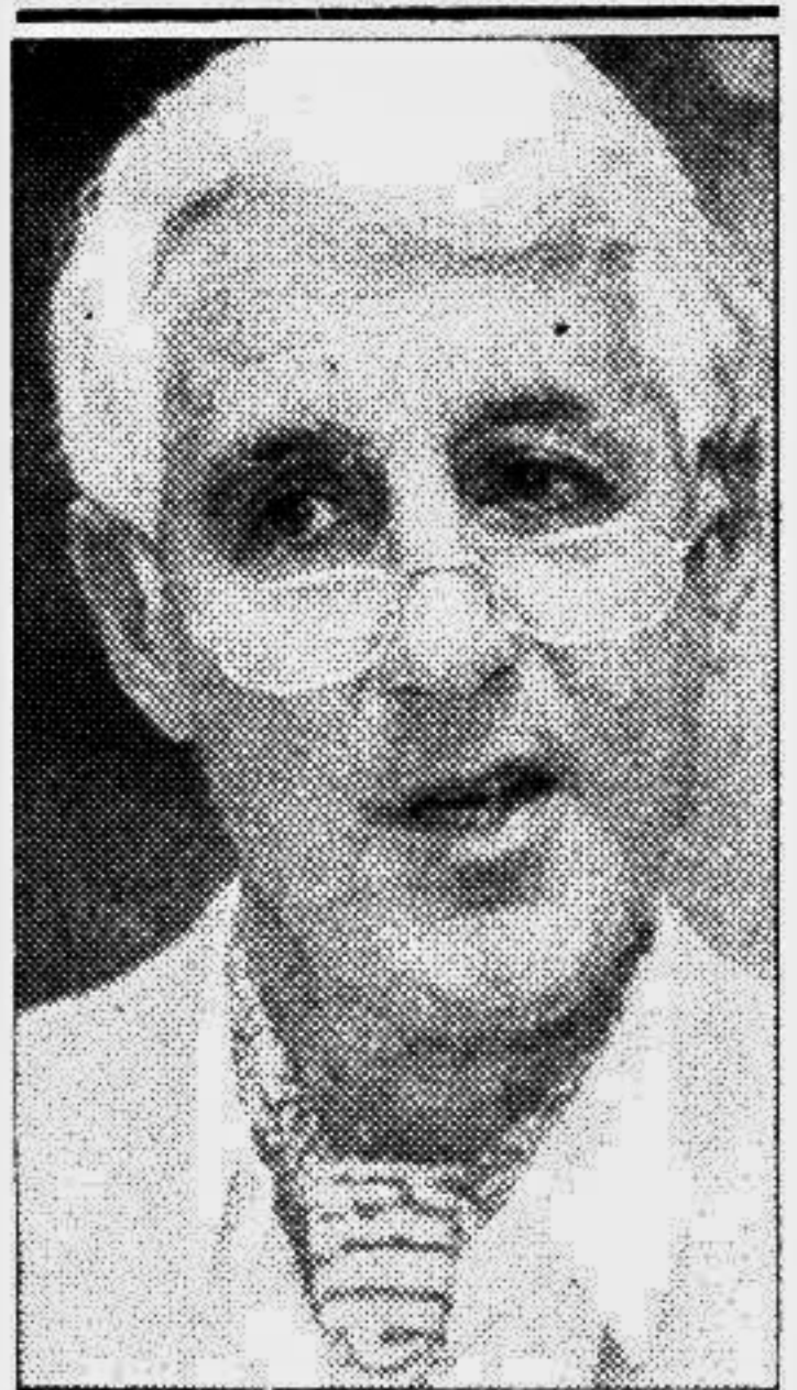
Mike Brearley (Former England cricket captain)

"A winning skipper is one who has a passion for tactics, has the ability to apply psychological pressures and is good at both individual and team psychology."