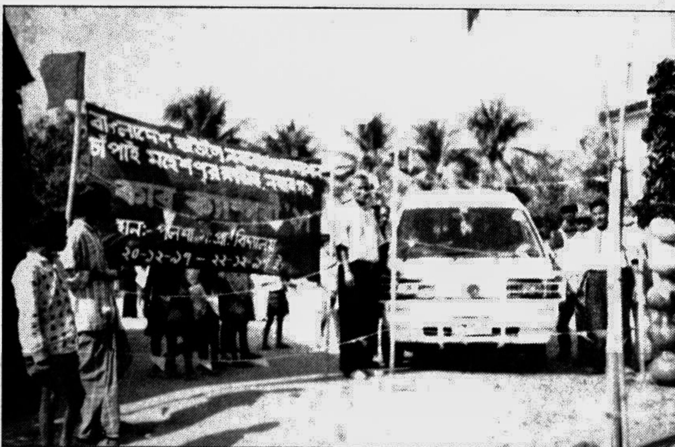
CHAPAI NAWABGANJ: A three-day Cub campy concluded recently at Palsha Government Primary School here. Nawabganj Thana Education Office (primary) arranged it.