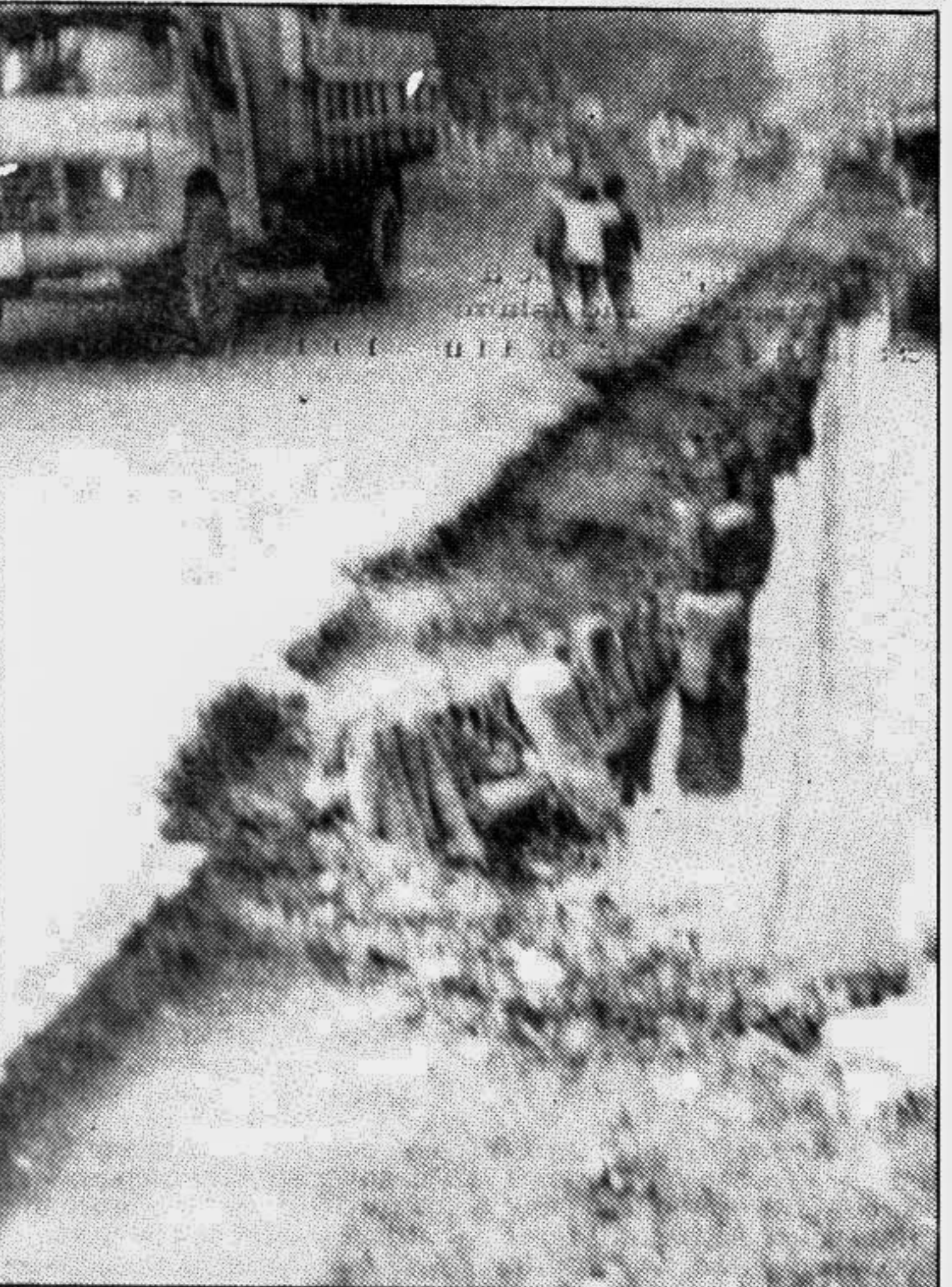
RAJSHAHI: Cracks are frequently developed at Ramchandrapur point on Rajshahi-Dhaka highway. Temporary measures are taken always to save the road. But again it cracks after sometime threatening smooth road communication.