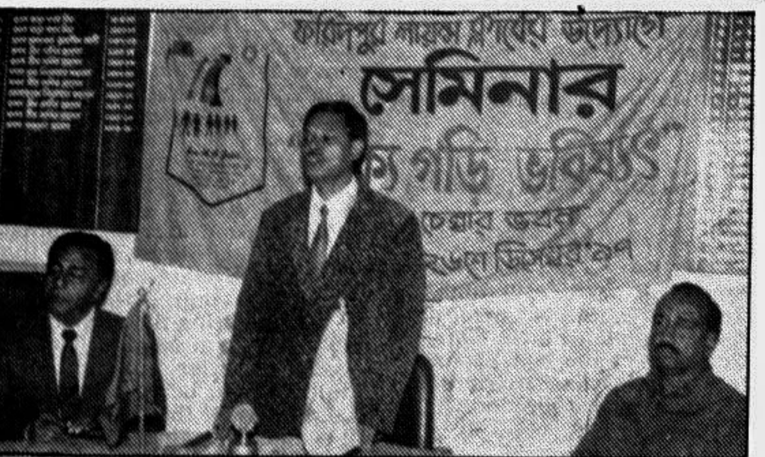
FARIDPUR: A seminar on "Unity Builds Future" was recently arranged by Faridpur Lions Club at the local chamber building.

The farm earned Tk 1.50 lakh selling 60 kgs of fry in the current season. But its future hangs in the balance due to mismanagement and reluctance of the employees.