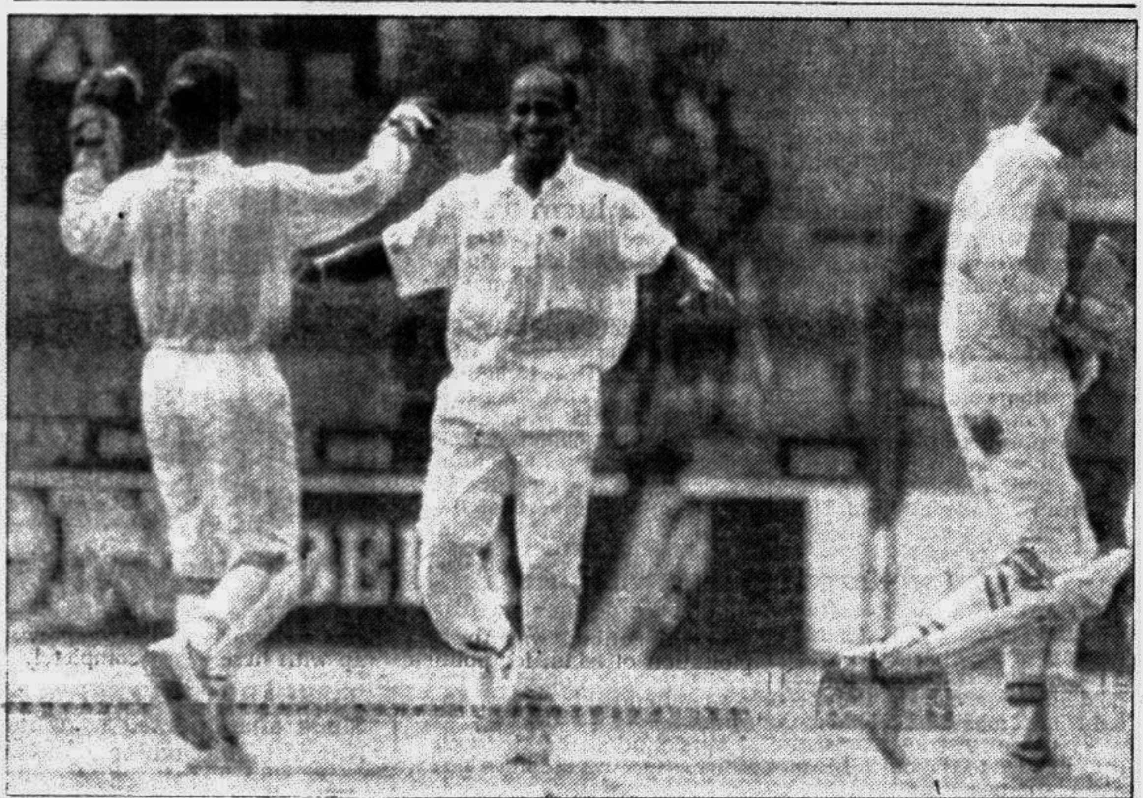
Lankan superstar Sanath Jayasuriya and wicketkeeper Romesh Kaluwitharana celebrate the fall of Zimbabwean Grant Flower during the second one-day international at Colombo yesterday. Sri Lanka won by five wickets.