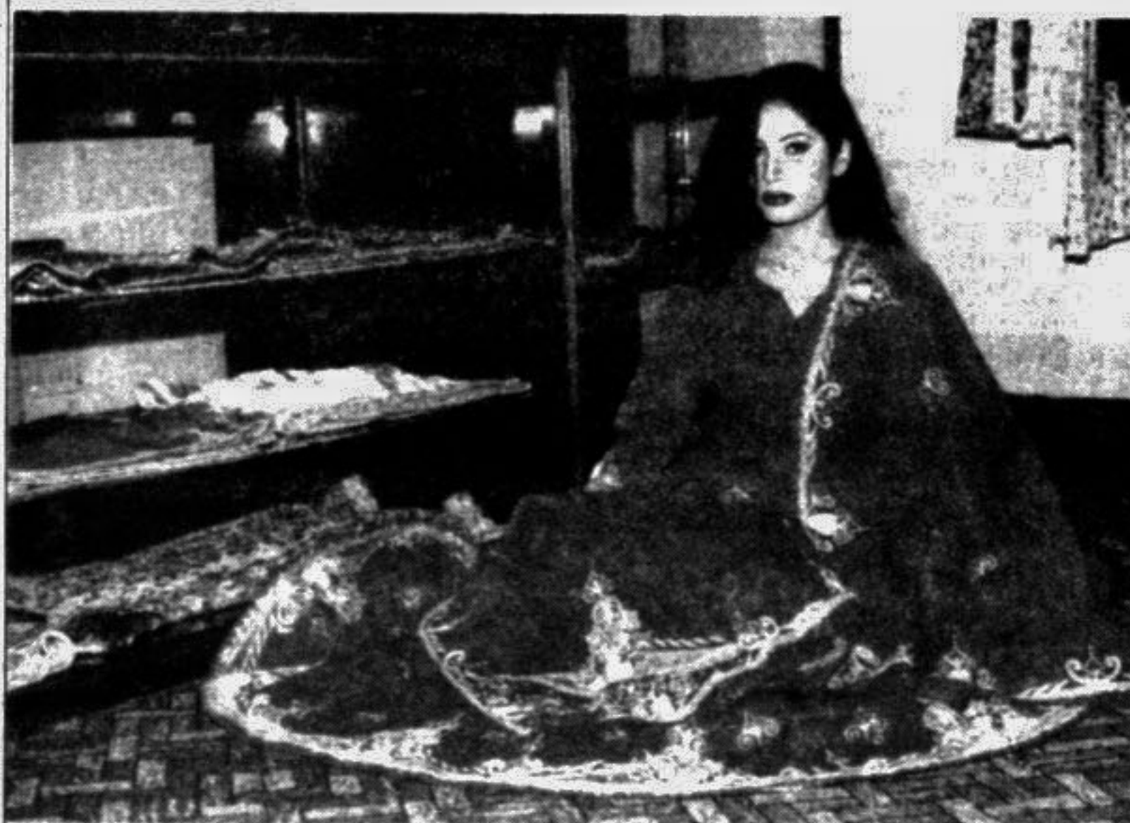
BELLISSIMO HOUSE OF FASHION HOUSE-29, RD-114, GULSHAN

BELLISSIMO HOUSE OF FASHION IS NOW GIVING DISCOUNT ON EVERY ITEM! WITH THE ARRIVAL OF THE EID COLLECTION WE HAVE TRIPLED OUR COLLECTION AND NOW IT IS BETTER THAN BEFORE. FOR EXCLUSIVE LEHGAS AND SALWAR KAMEEZ COME TO BELLISSIMO