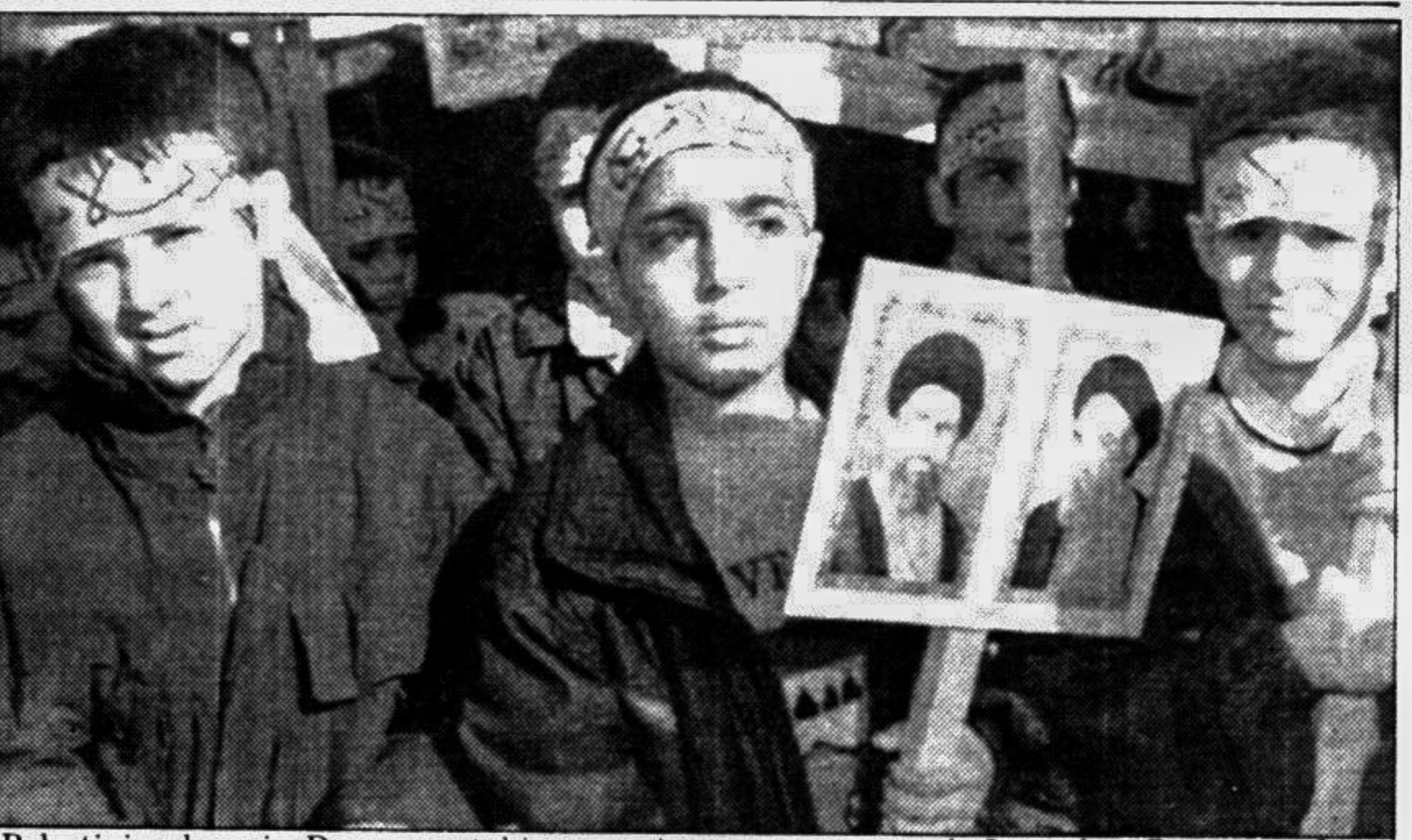
Palestinian boys in Damascus taking part in a protest to mark Jerusalem Day yesterday. The day was declared in 1981 by Iran's late spiritual leader Ayatollah Khomeini who said Muslims should observe the last Friday of Ramadan to protest Israel's capture of Arab East Jerusalem in the 1967 Middle East War.