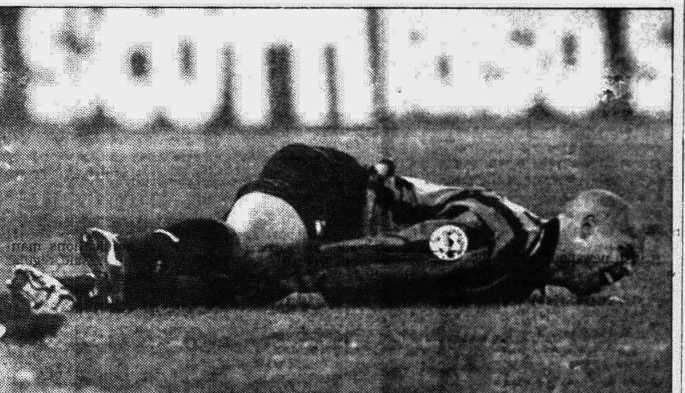
THE PRICE SUPERSTARS HAVE TO PAY: Inter Milan's Ronaldo cries in anguish during one of the repeated assaults inflicted on him by AC Milan defenders during a quarterfinal second leg clash of the Italian Cup at the San Siro stadium in Milan on Jan 21. Inter won 1-0.