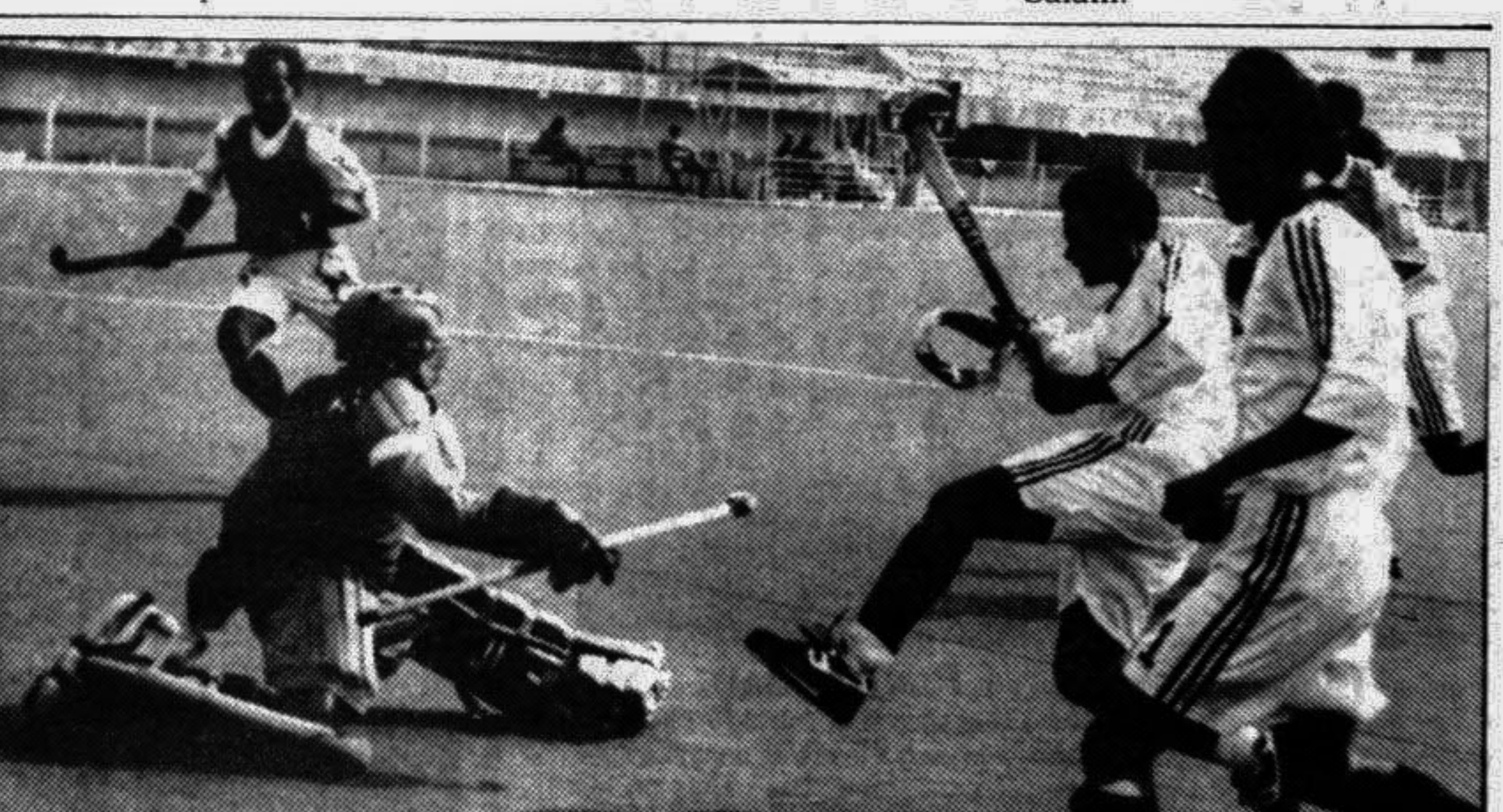
Action from yesterday's 20th national hockey championship quarter-final match between Dhaka University and Bangladesh Navy at the National Hockey Stadium. Dhaka University won 4-0.