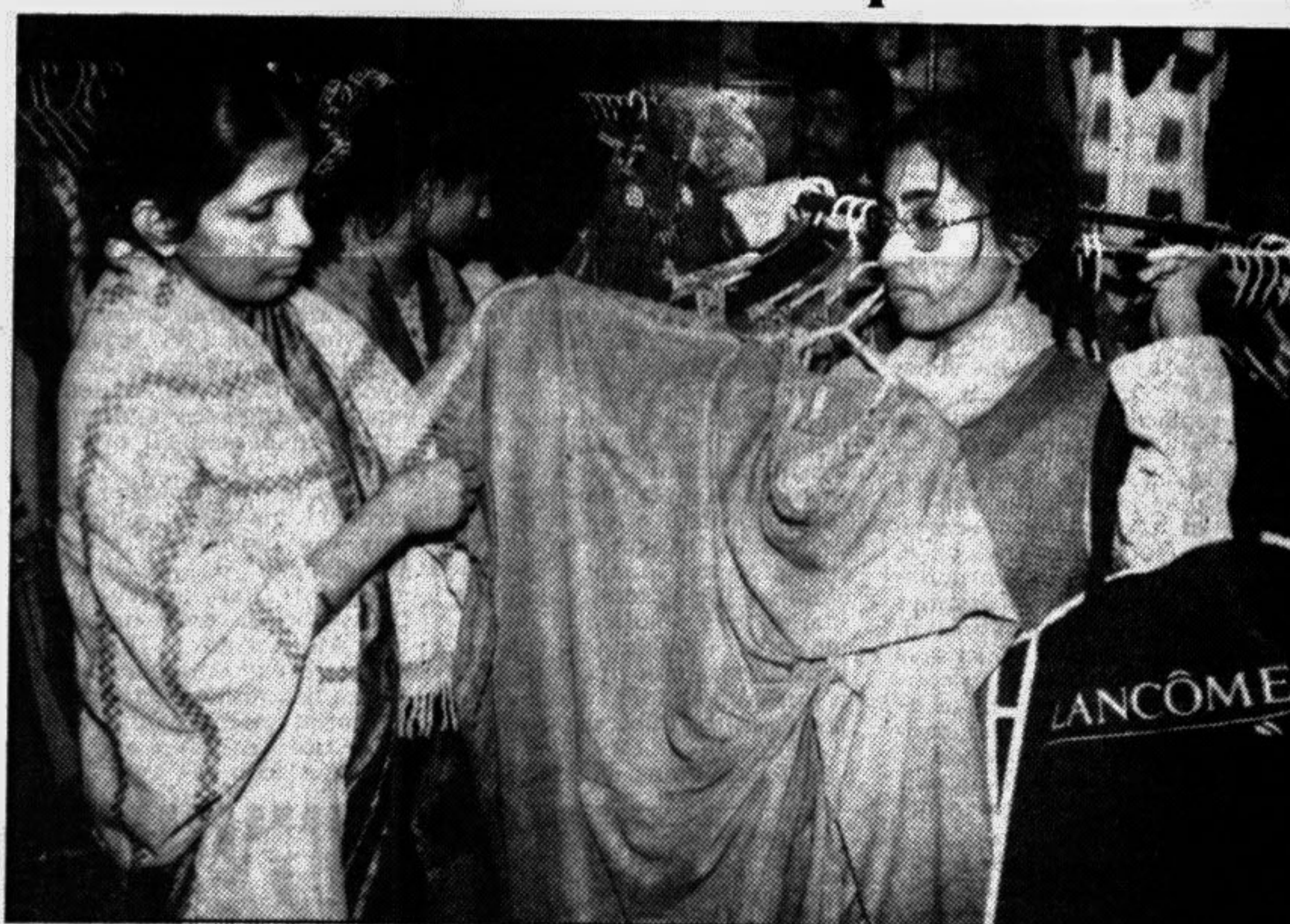
Eid-buying spree in a city market yesterday.