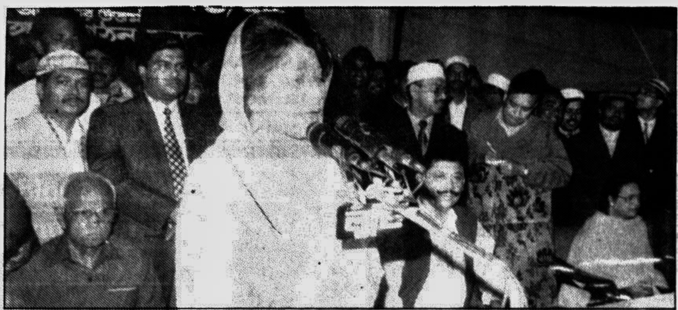
The Leader of the Opposition and BNP Chairperson Begum Khaleda Zia addressing the 1st party in the city yesterday organised by the front organisations of the Bangladesh Nationalist Party.