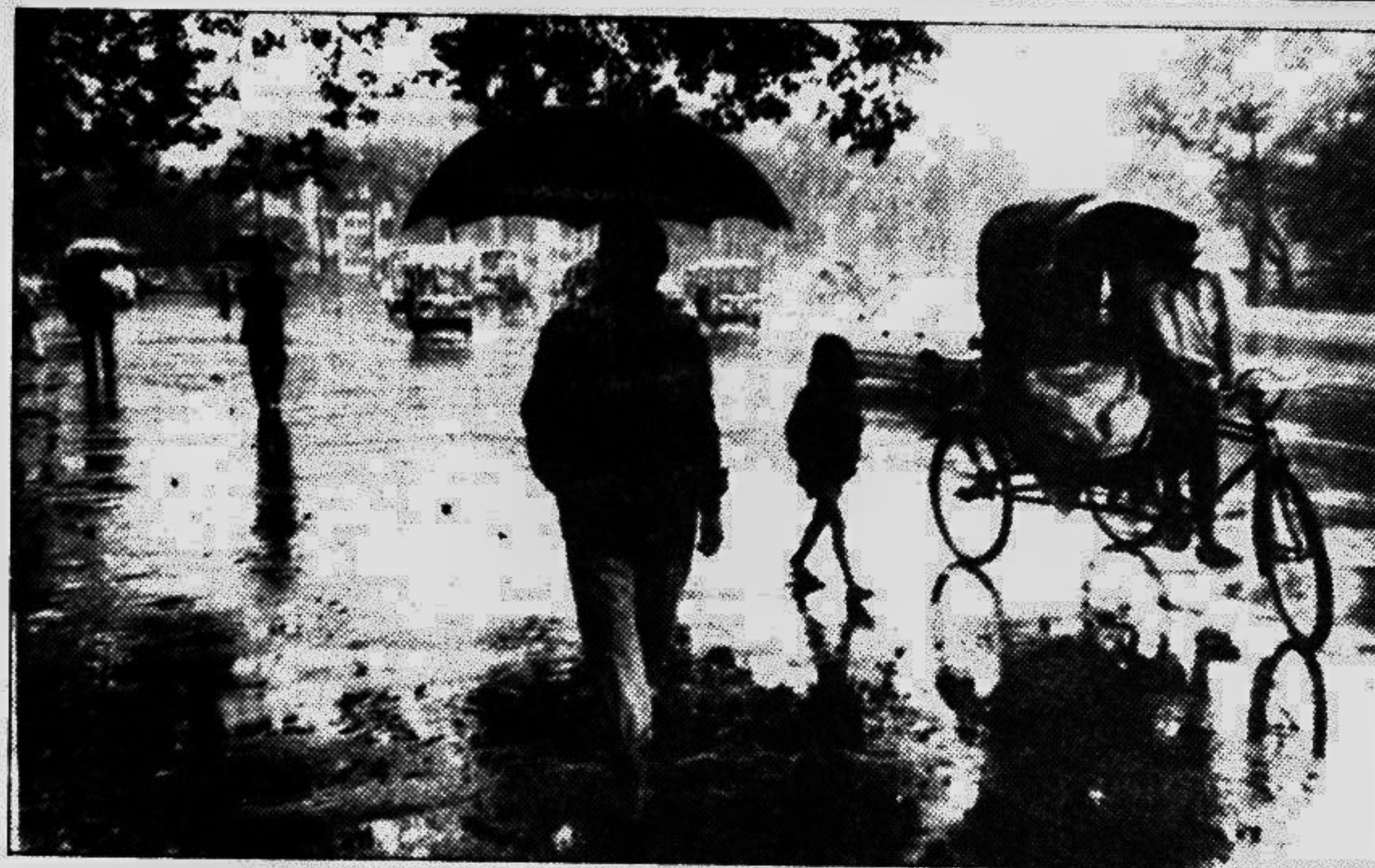
Rain disrupted normal life in the city yesterday.