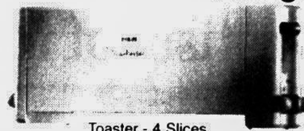
Toaster - 4 Slices